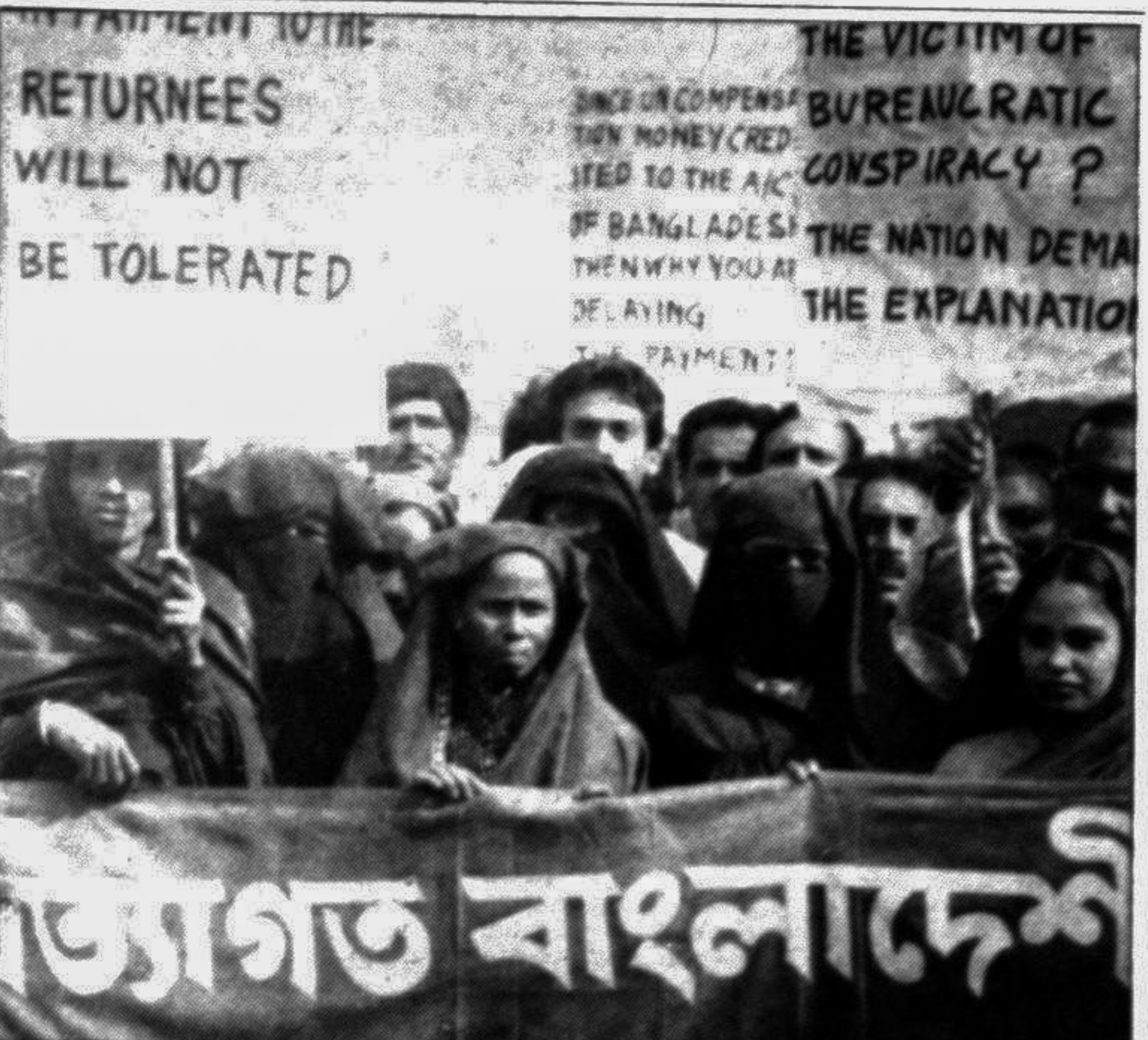
Kuwait returnees brought out a procession in the city yesterday demanding immediate payment of compensation.

This situation has been further aggravated due to reduction of upstream fresh water flow and it has prompted the agency to undertake a study with FAO/UNDP assistance to make suitable recommendations for integrated and sustainable development of all forest resources.