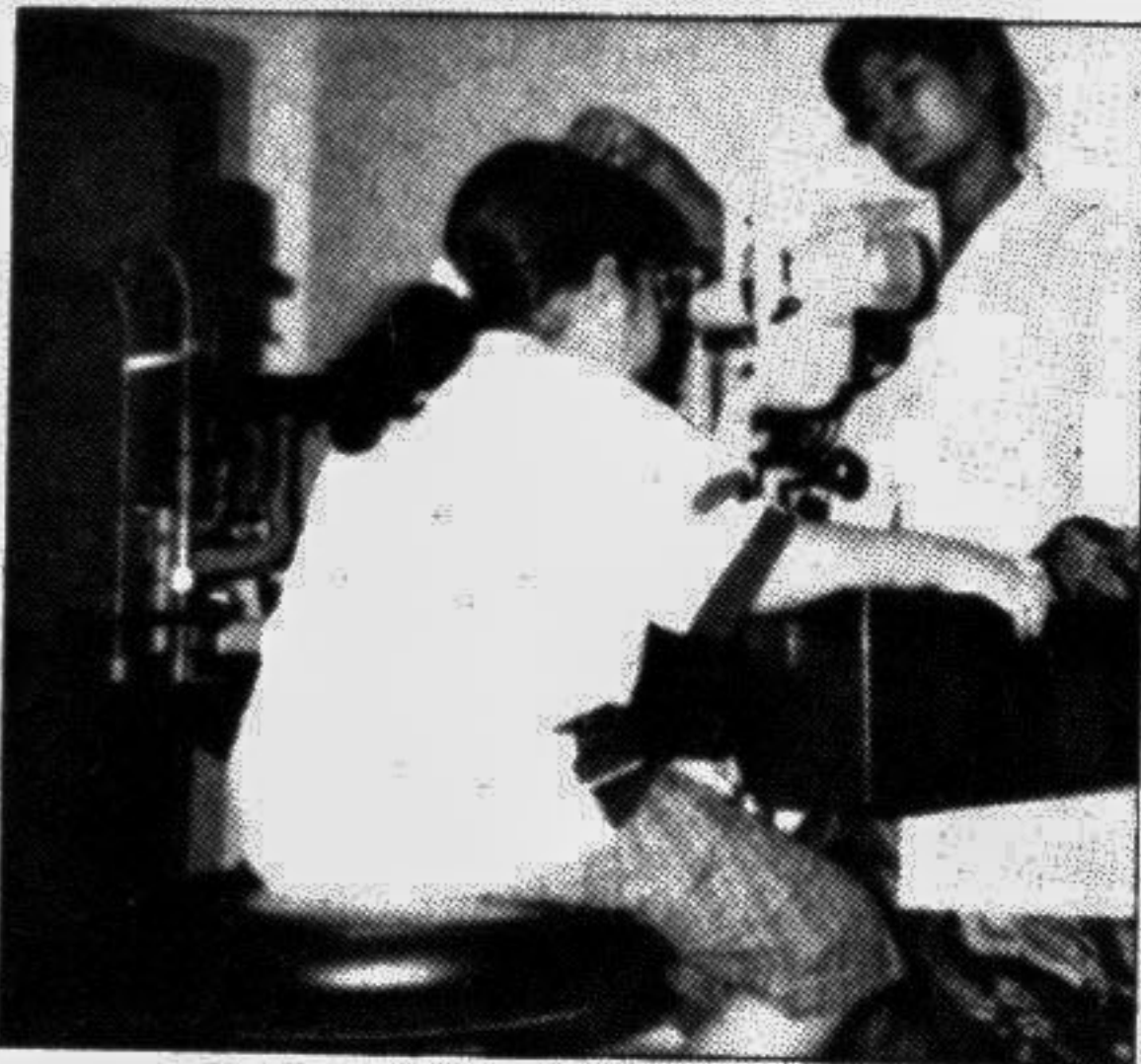
A patient receiving pleoptic exercises.