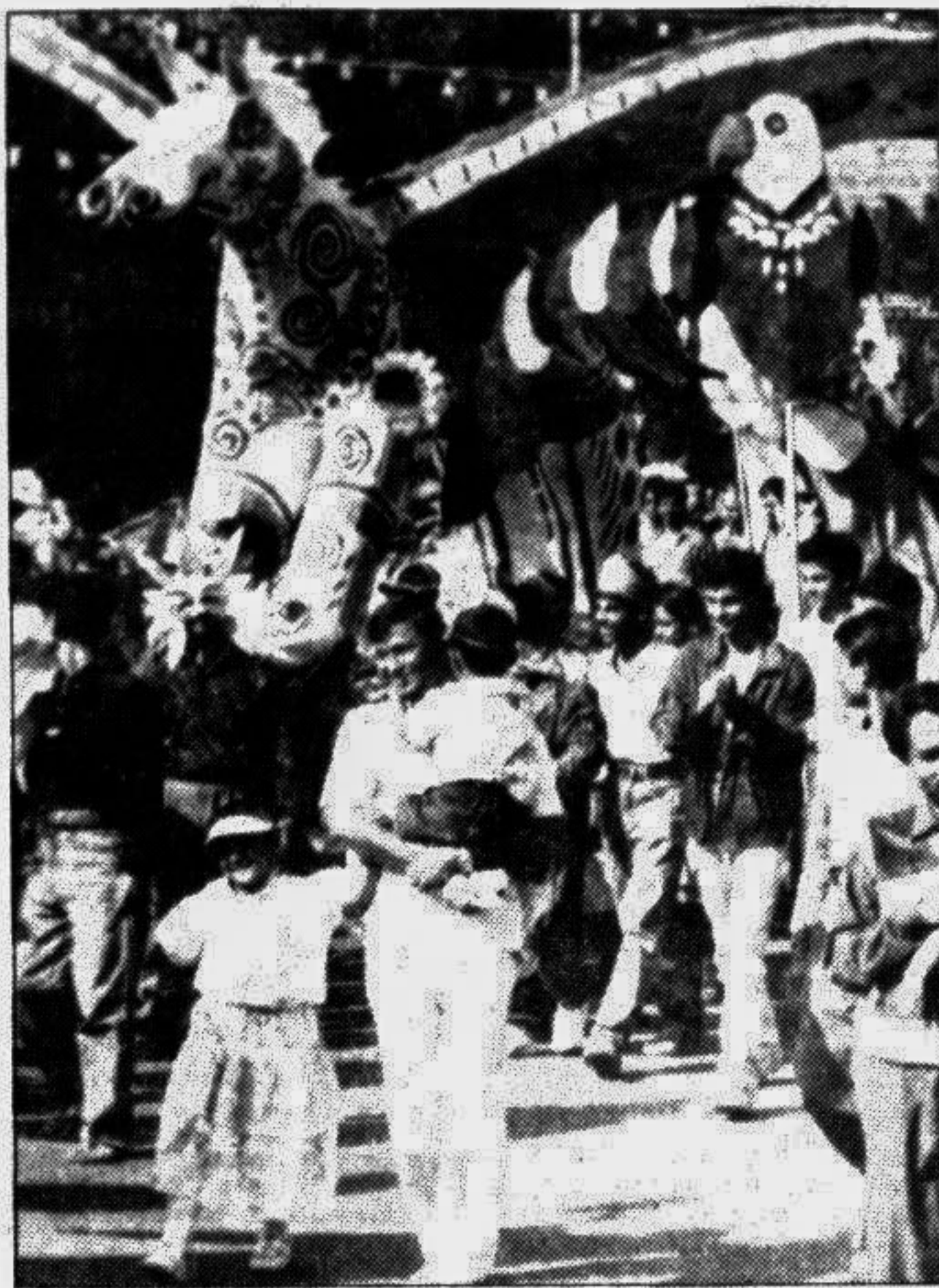
Sammilita Sangskritik Jote brought out a colourful procession in the city in celebration of the silver jubilee of independence.

*Scheduled Charter Service operated by Dragonair Holidays