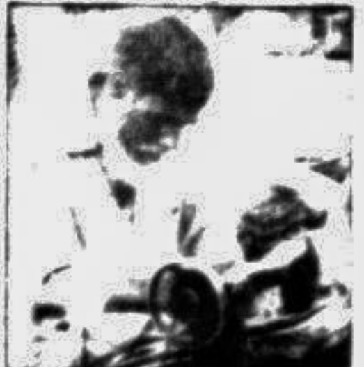
Tale of Roadside Tailors Page 3