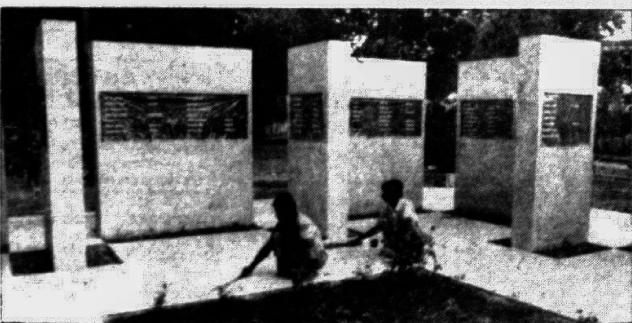
The memorial for the martyred teachers of the Dhaka University in 1971 built in front of the VC's residence will be inaugurated today.

Twenty-five honorary lieutenants and 36 junior commissioned officers have been granted honorary commission in the rank of honorary captain and honorary lieutenant respectively on the active list of the Bangladesh Army with effect from today.