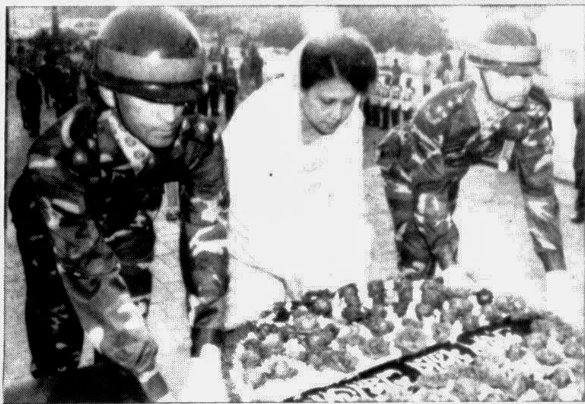
Prime Minister Begum Khaleda Zia placing wreaths at the Martyred Intellectuals Memorial at Mirpur in the city yesterday.