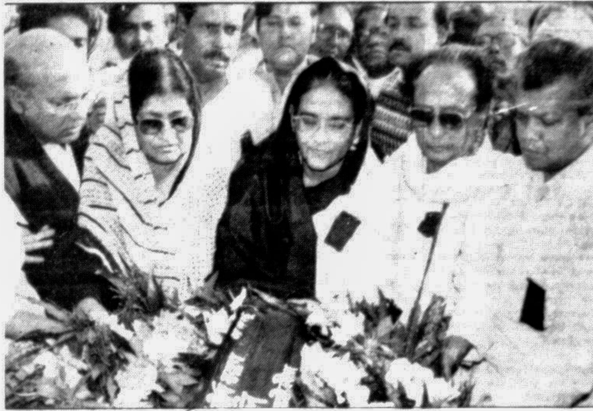
Awami League president Sheikh Hasina and senior leaders placing wreaths at the Martyred Intellectuals Memorial at Mirpur in the city yesterday.