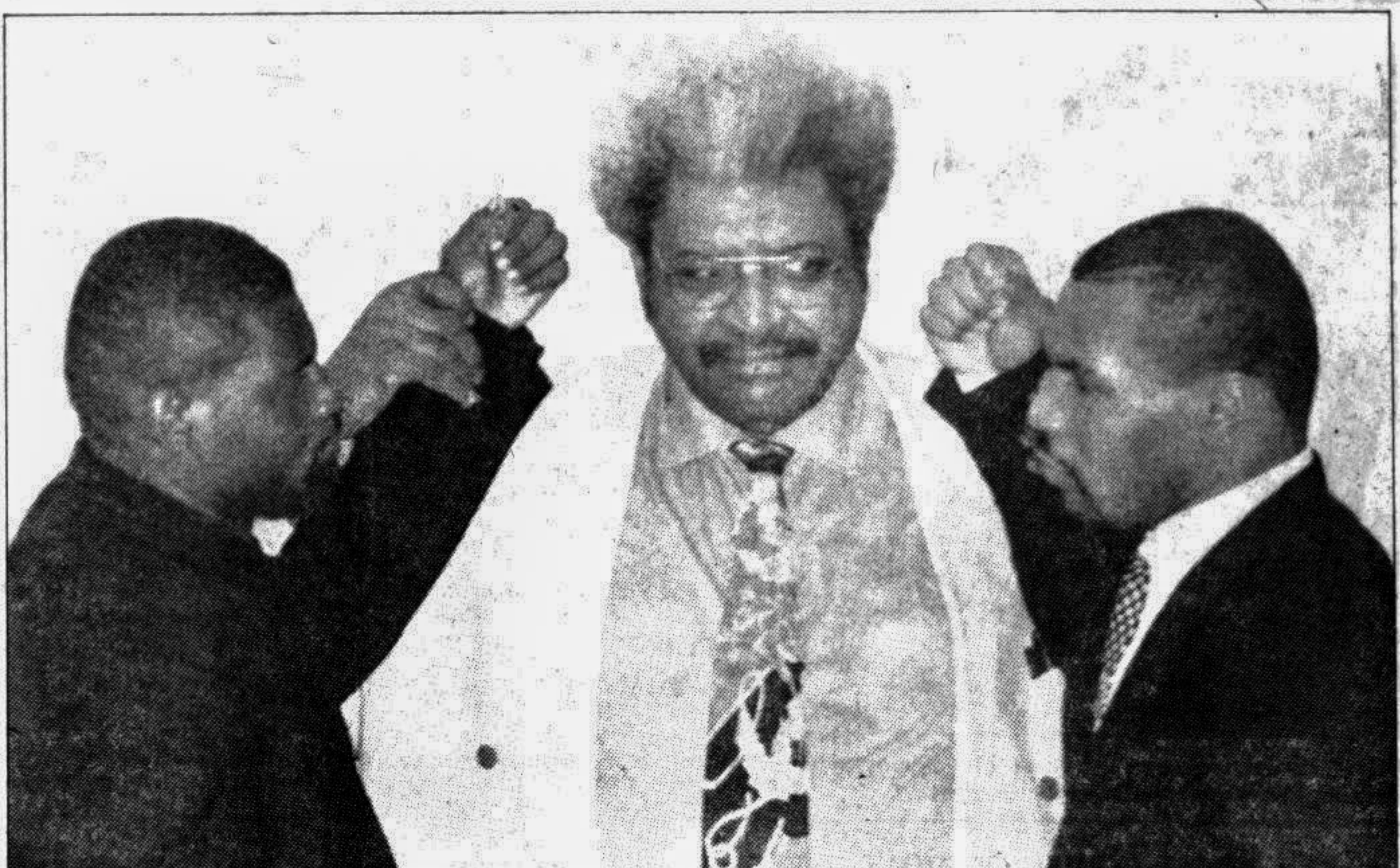
Prior to Dec 16 fight, promoter Don King (C) brings former world heavyweight boxing champion Mike Tyson (R) and Buster Mathis face to face at a press conference in Philadelphia on Dec 13.

The first three World Cups in England in 1975, 1979 and 1983 were sponsored by Prudential Insurance, the fourth, held in India and Pakistan in 1987, was sponsored by Indian textile giant Reliance.