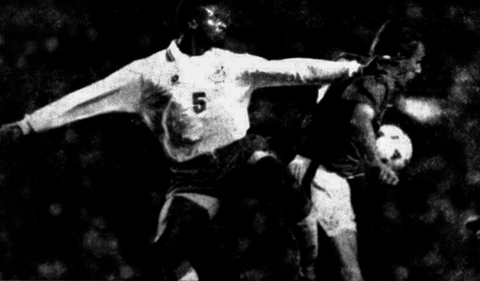
Tony Cascarino (R) of Ireland tries to stymie Dutch Winston Bogarde during their crucial European Championships qualifying play-off in Liverpool on Dec 13. The Hollanders won 2-0 to ensure the last berth in the Championships.

He only lasted for two minutes after the break before being substituted by Jason McAteer, a move which