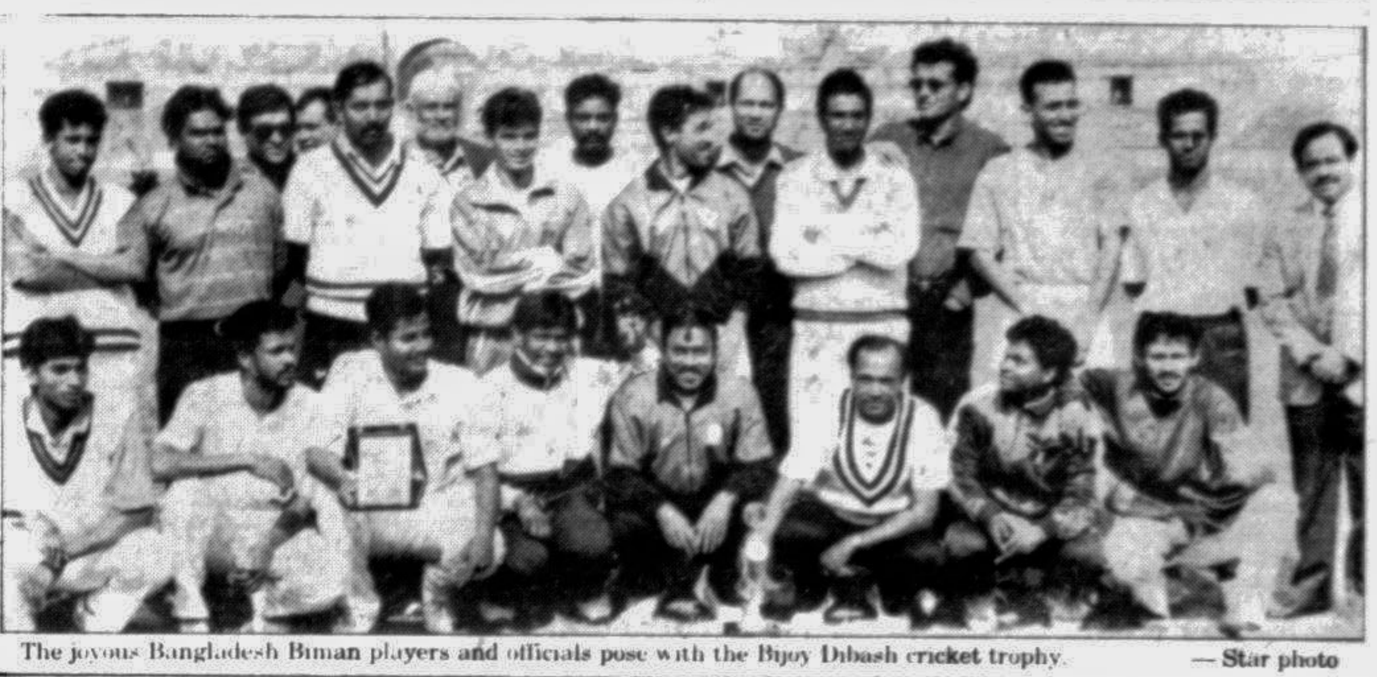
The joyous Bangladesh Biman players and officials pose with the Bijoy Dibash cricket trophy.