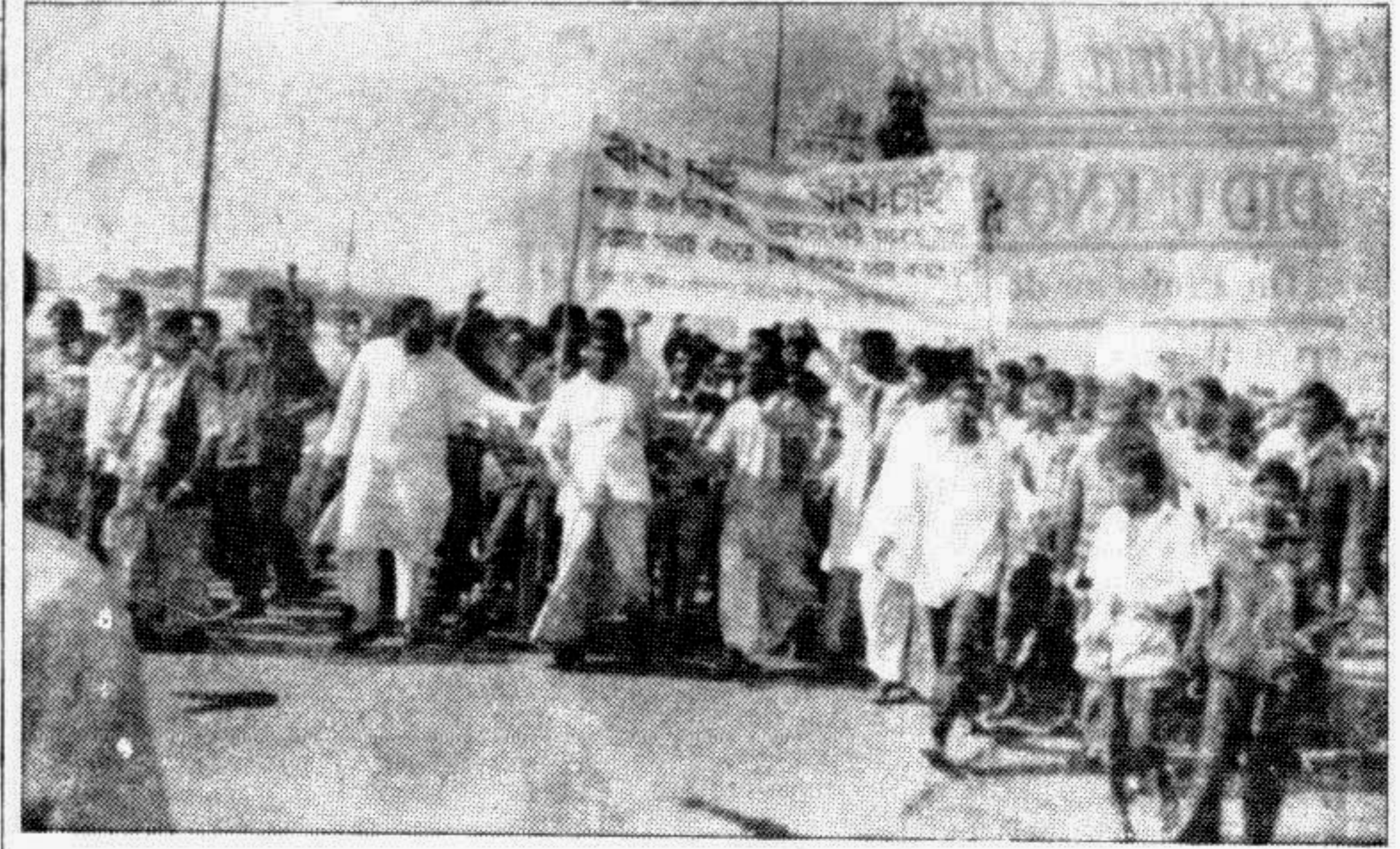
CHAPAINAWABGONJ: Thousand of people of the 'char' areas brought out a large procession demanding construction of a barrage to check erosion of Padma.