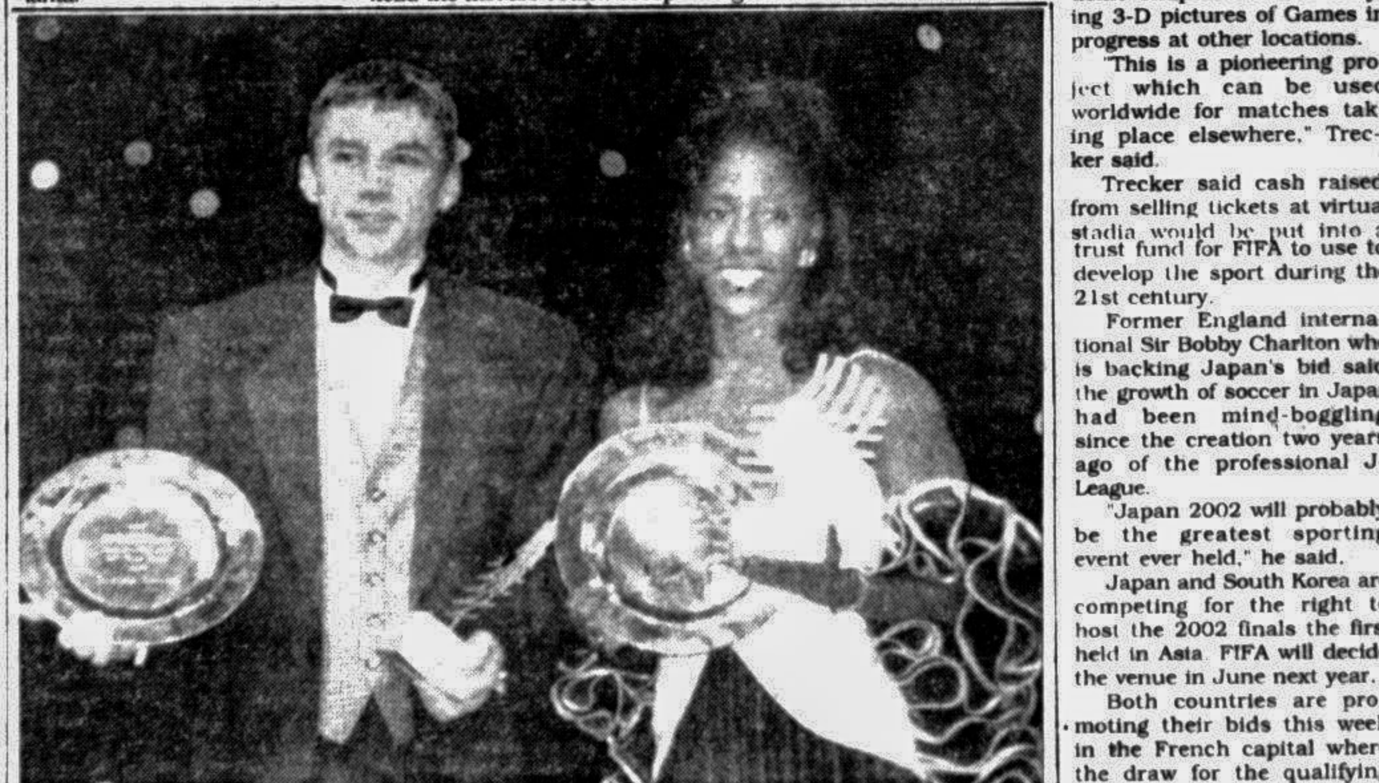
Athletes-of-the-year Briton Jonathan Edwards and American Gwen Torrence pose with their trophies during the IAAF gala in Monaco on Dec 9.

Both countries are promoting their bids this week in the French capital where the draw for the qualifying competition of the 1998 finals in France is being held on Tuesday.