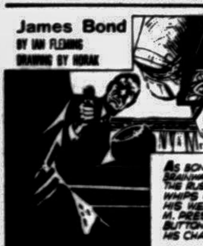
James Bond BY IAN FLEMING DRAWING BY MORAN

The writer is former Collector of Customs.