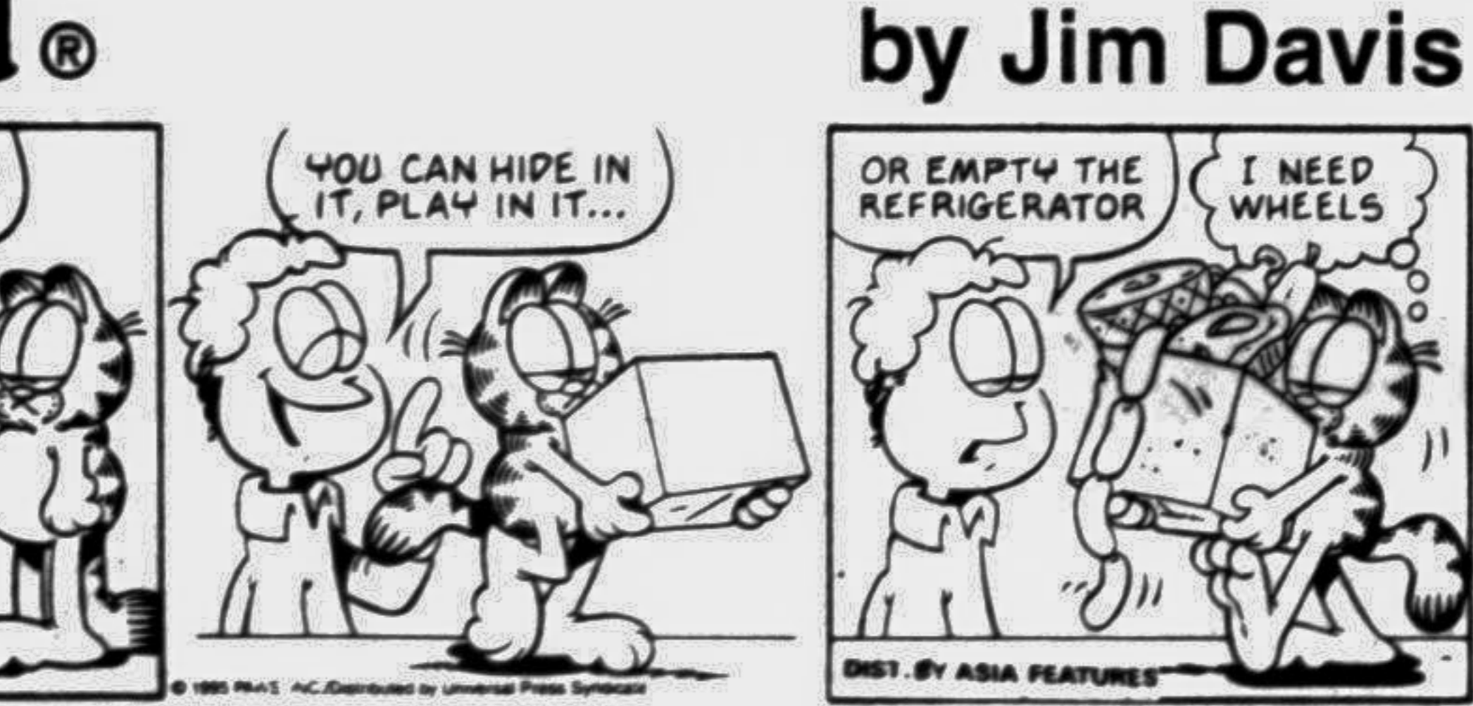
Garfield® by Jim Davis