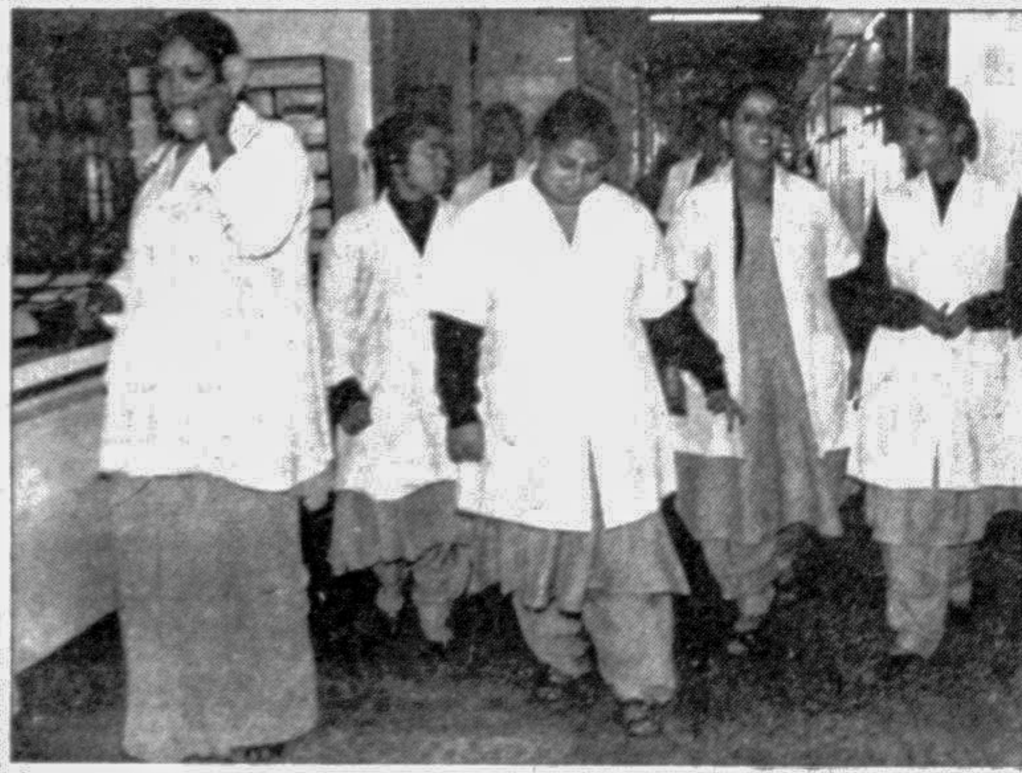
Indian nurses wore traditional Indian dress instead of white uniforms yesterday to protest their portrayal in a popular television comedy "Dil Ka Doctor" (Doctor of Hearts).

The interview will be held from 9 am everyday.