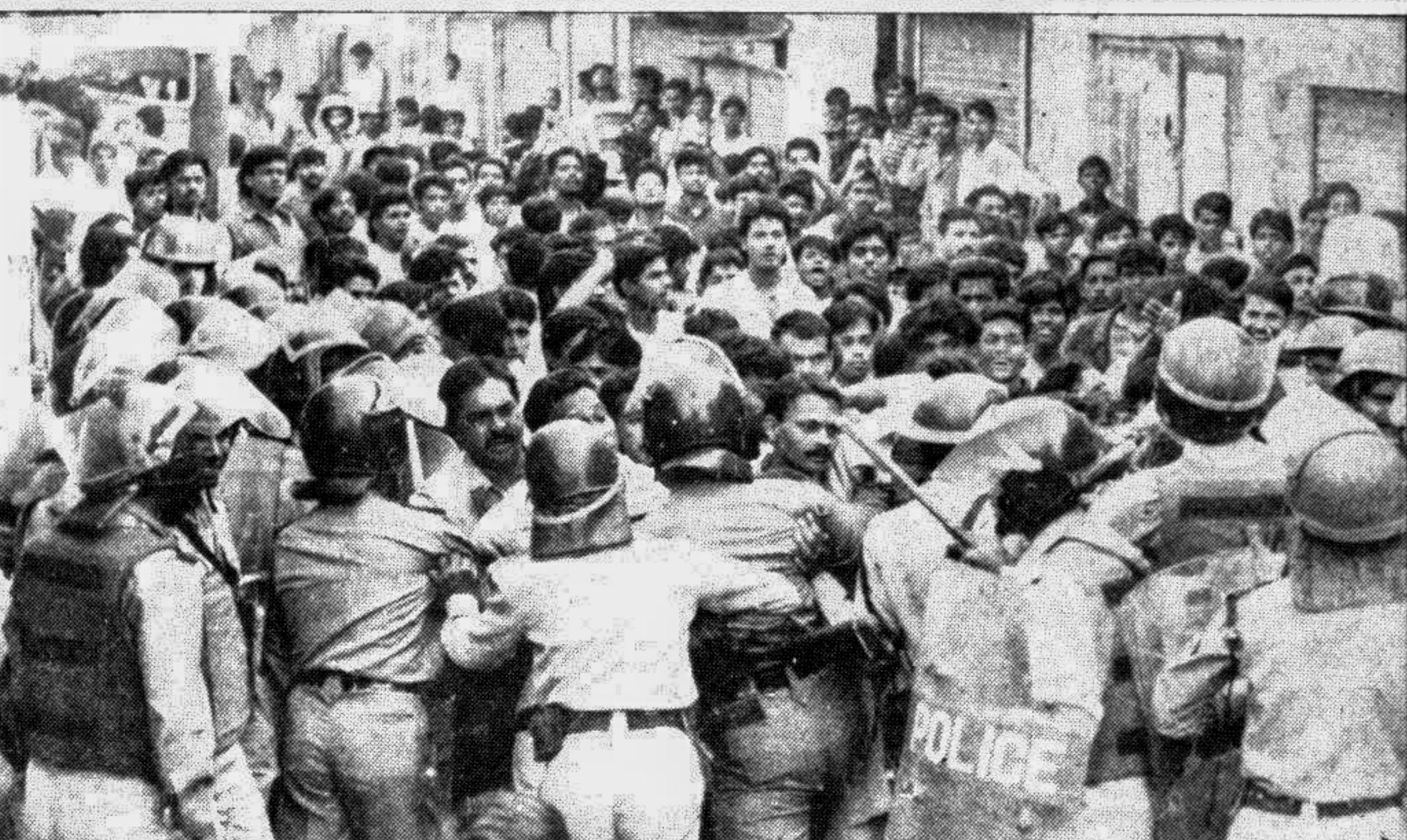
Police trying to prevent a clash between supporters of the BNP and the Awami League at Abul Hasnat Road in the city during hartal hours yesterday.

A group of muggers hurled cocktails at a tempo and robbed its passengers of cash and valuables worth about Tk 50 thousand at Miztuzi of Shiddhirganj thana under. See Page 12 Col 8