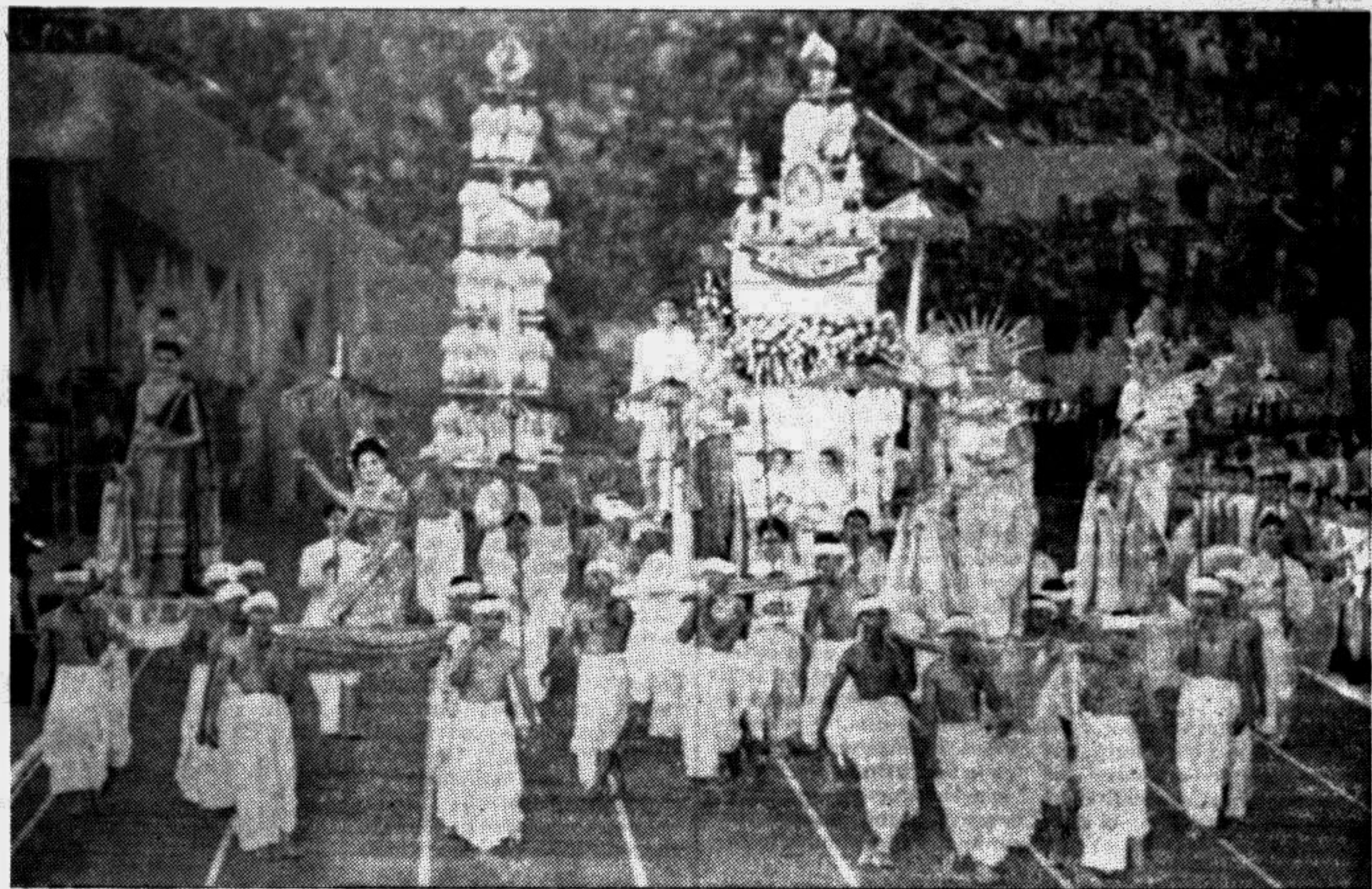
Thai women attired in traditional costumes from different tribes are paraded during the opening ceremony of the 18th Southeast Asian Games at the Chiang Mai stadium in Thailand yesterday.

The other semifinal pits home favourite Boris Becker against world number 18 Todd Martin of the United States.