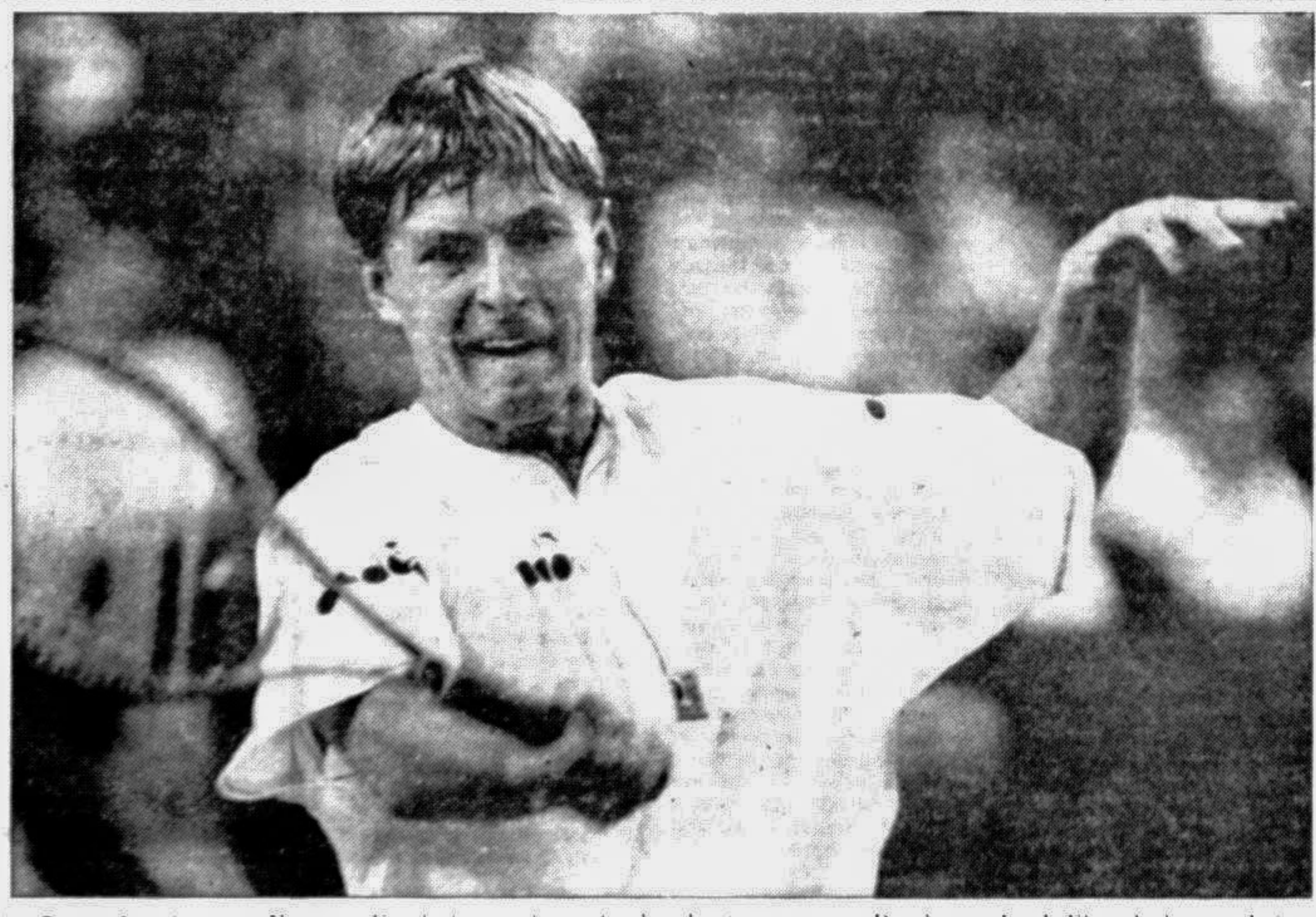
Rising Russian star Yevgeny Kafelnikov makes a forehand return against Dutchman Jacob Eltingh during their quarterfinal match in the six-million dollar Grand Slam Cup in Munich on Friday. Kafelnikov won 6-3, 3-6, 6-2.