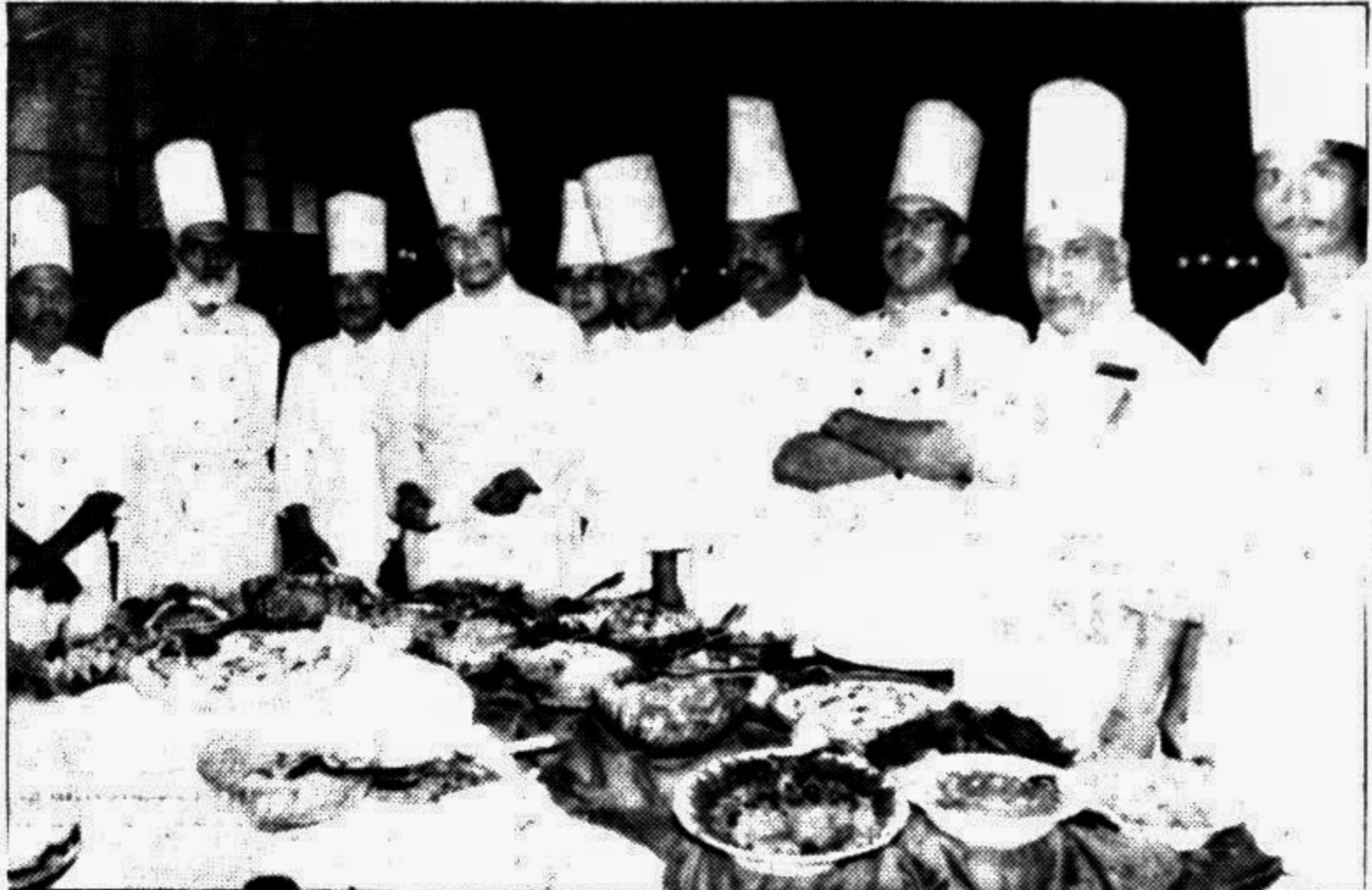
A seven-day food festival of the SAARC countries began at the Dhaka Sheraton Hotel yesterday to mark the 10th founding anniversary of SAARC.

From Staff Correspondent CHITTAGONG Dec 8: Arrival of foreign cargo vessels at Chittagong port in recent days marks a downward trend. According to port sources, as a result, the traffic-jam of cargo vessels at the outer anchorage has now totally eased. The turn around period of ships on average comes down to 5 days as against 15 to 7 days earlier. A senior official of the port said we don't have ships waiting for berthing at the outer anchorage and for that reason some of the port jetties are sure to wear a vacant look now," he added. He attributed the downward trend to fall in number food grain carrying ships and container vessel which earlier used to call in large numbers.