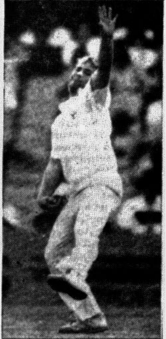
WARNE... Man-of-series lunch, his third wicket of the session.

McDermott b Waqar 0 Reffel not out 2 McGrath b Waqar 0 Extras: (lb-5; nb-3) 8 Total: (all out) 172 Fall of wickets: 1-42; 2-69; 3-117; 4-126; 5-146; 6-152; 7-170; 8-170; 9-172. Bowling O M R W Akram 16 5 25 2 Waqar Younis 6.1 2 15 3 Mushtaq Ahmed 30 6 91 4 Saqlain Mushtaq 13 5 35 1 Aamir Sohail 1 0 1 0 Result: Pakistan won by 74 runs. Australia won the series 2-1. Man of the match: Mushtaq Ahmed Man of the series: Shane Warne