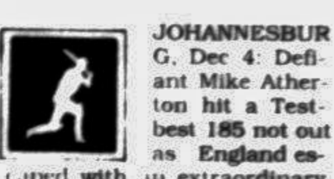
ATHERTON... 185 N.O

bowled Stewart and Mark Ramprakash within the space of three balls.