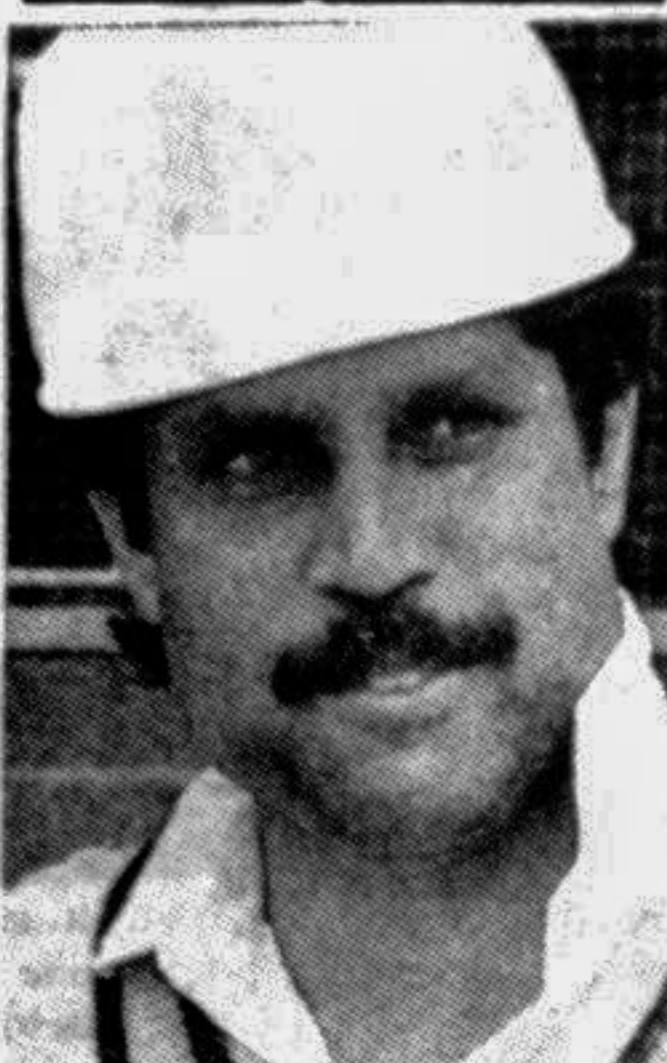
Kapil Dev (Great Indian all rounder) "Beautiful, fantastic, fabulous" On life after retirement.