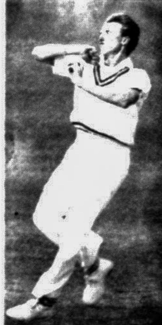
DONALD... 100th scalp

But there are still six wickets for us to take, including Atherton's. I have always said how good I think he is. He is aggressive and tough and he sets and example to everyone with his determination. That's why he's still at the crease."