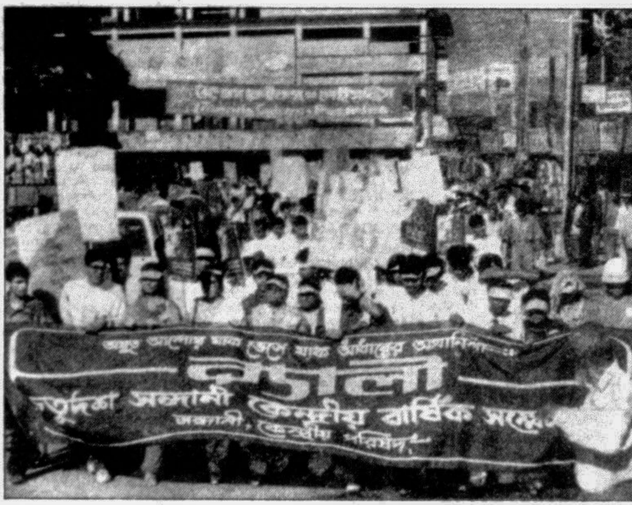
SYLHET: A colourful rally was brought out in Sylhet town on the inaugural day of the 14th National Conference of Sandhani recently.