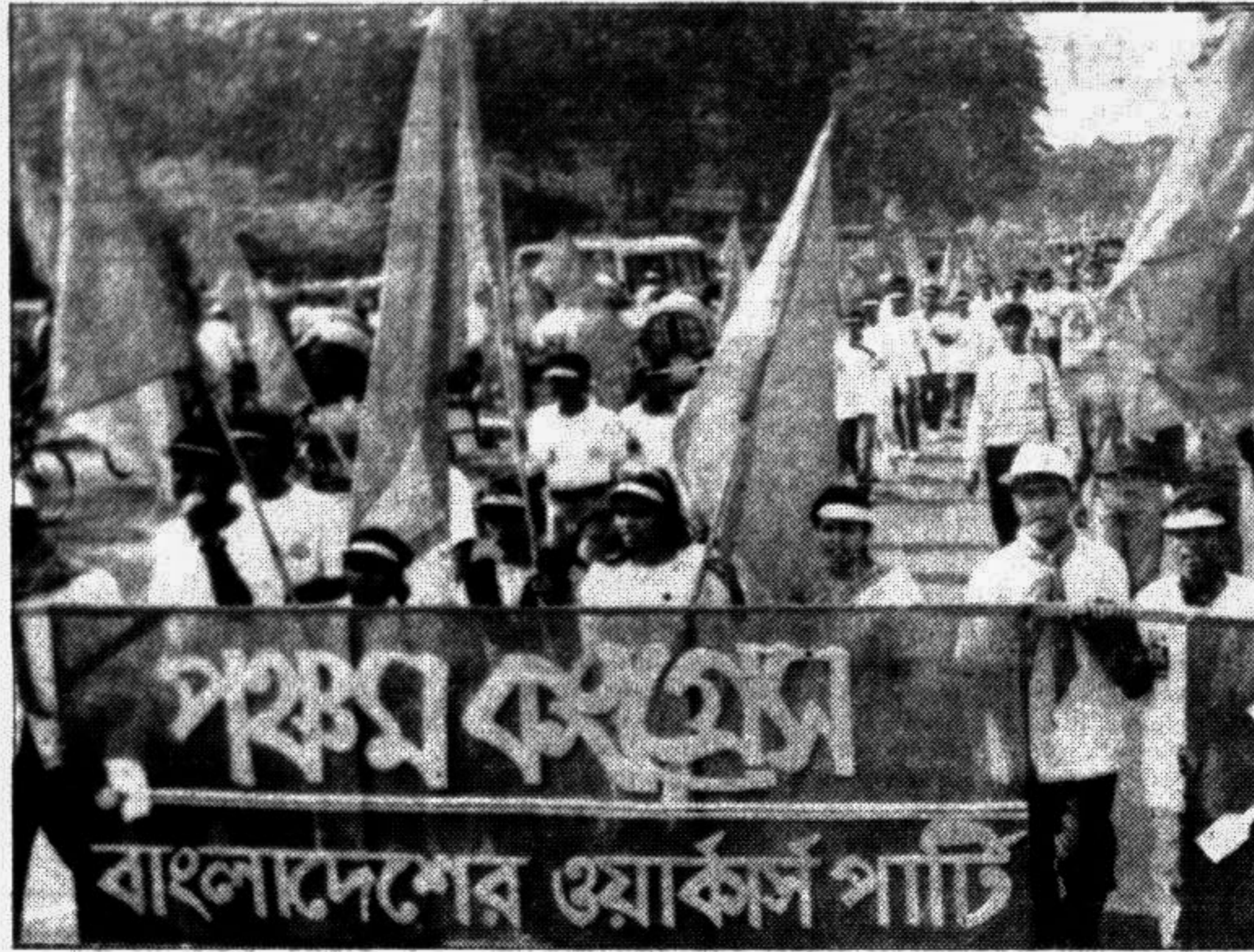
A colourful procession was brought out in the city marking the inauguration of the fifth congress of the Workers Party of Bangladesh which began in the city yesterday.