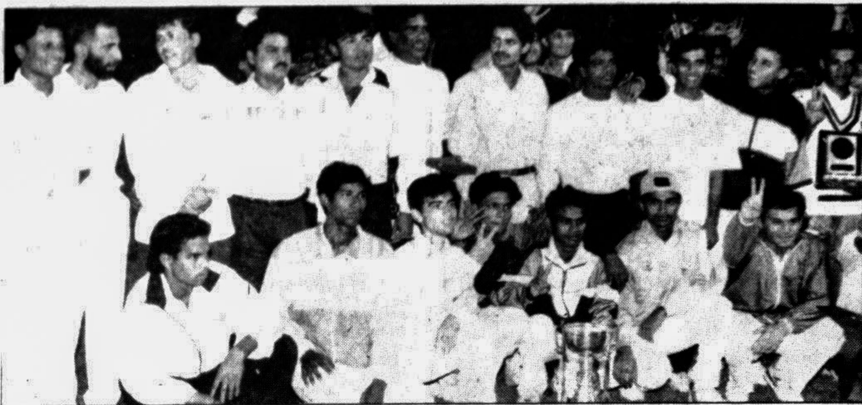
The jubilant Mohammedan Sporting Club cricketers and officials pose with the 16th Damal Summer cricket tournament trophy after they beat arch-rivals Abahani Krira Chakra by one wicket in the final at the Dhaka Stadium yesterday.