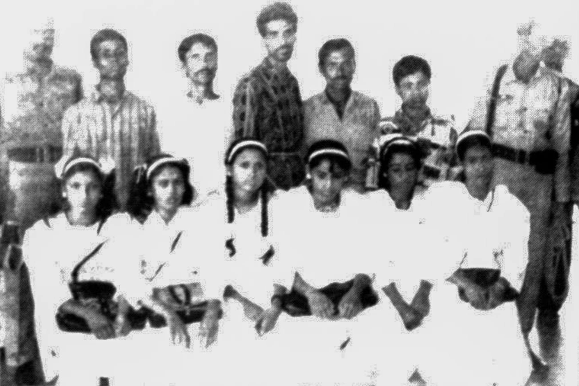
Demra police yesterday rescued these six teenage girls in school uniforms, who were brought to Dhaka from Narsingdi. Five alleged traffickers were also arrested.

By Staff Correspondent Police rescued six teenage girls from a bus near Jatrahari in the city yesterday and arrested five persons on suspicion of trafficking. The arrested persons were accompanying the girls from Narsingdi. Police intercepted the bus near a petrol pump close to the Saddam Market at Jatrahari at about 10:00 am. The arrested persons, mostly aged between 35 and 40, were taking the girls to Dhaka from Narsingdi, according to sources. The rescued girls were disguised in white school uniforms. Sources said that the girls