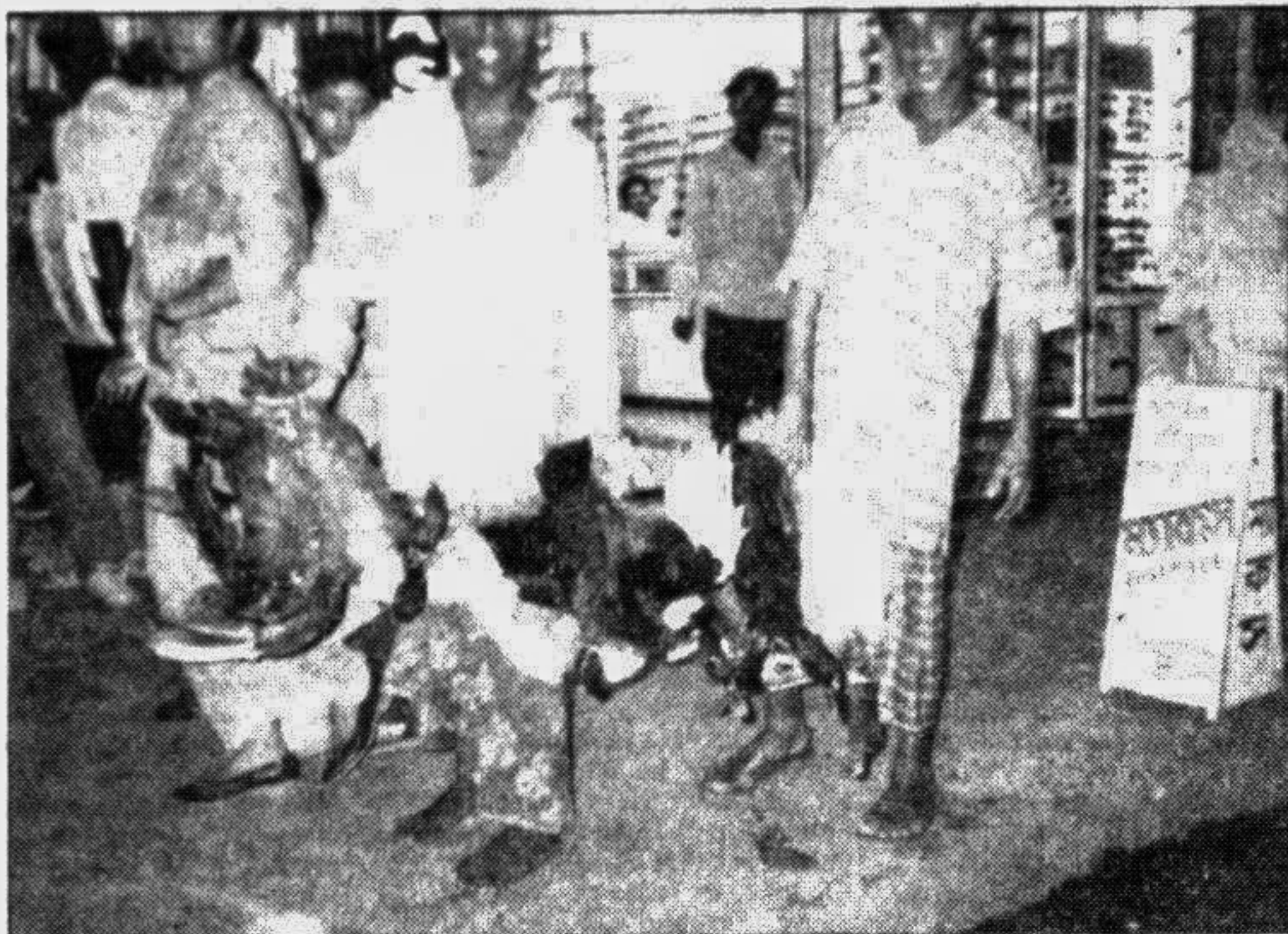
Birds on sale.