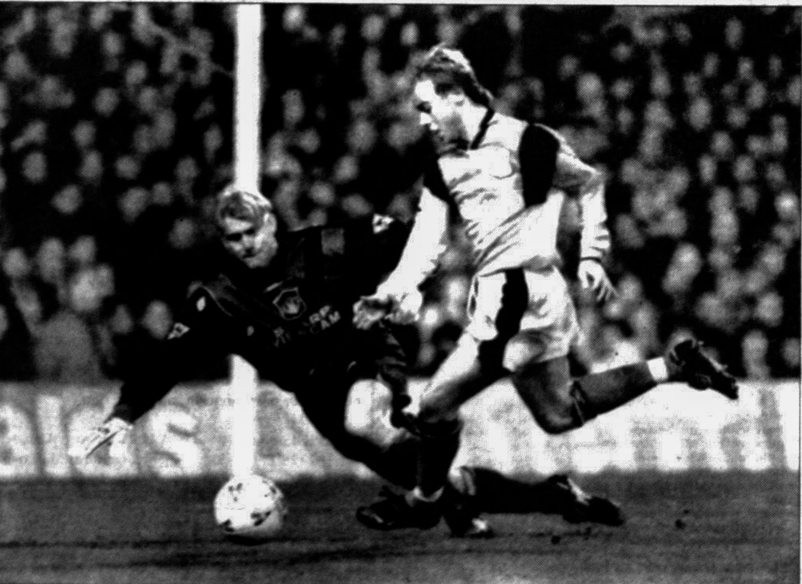
Manchester United's goalkeeper Peter Schmeichel dives to his left to stymie a Nottingham Forest attack during their Premiership league tie in Nottinghamshire on Nov 28. The match ended in a 1-1 draw.

Eventually the then Prime Minister, the late Indira Gandhi had to intervene on the issue.