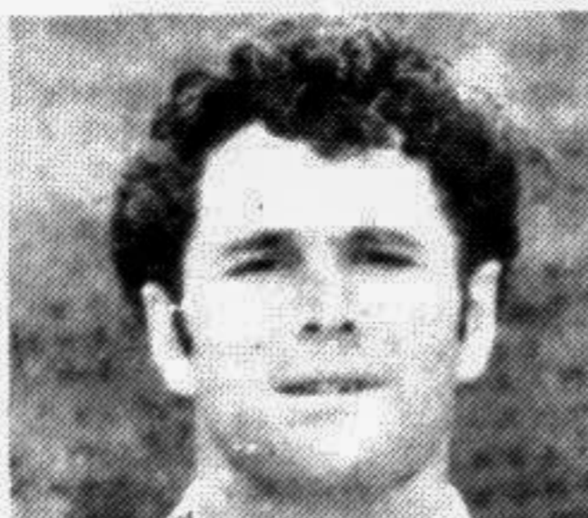
CAIRNS ... 103

Vinod Kambli added 71 for the third wicket with skipper Mohammad Azharuddin, before he was run out for 43.