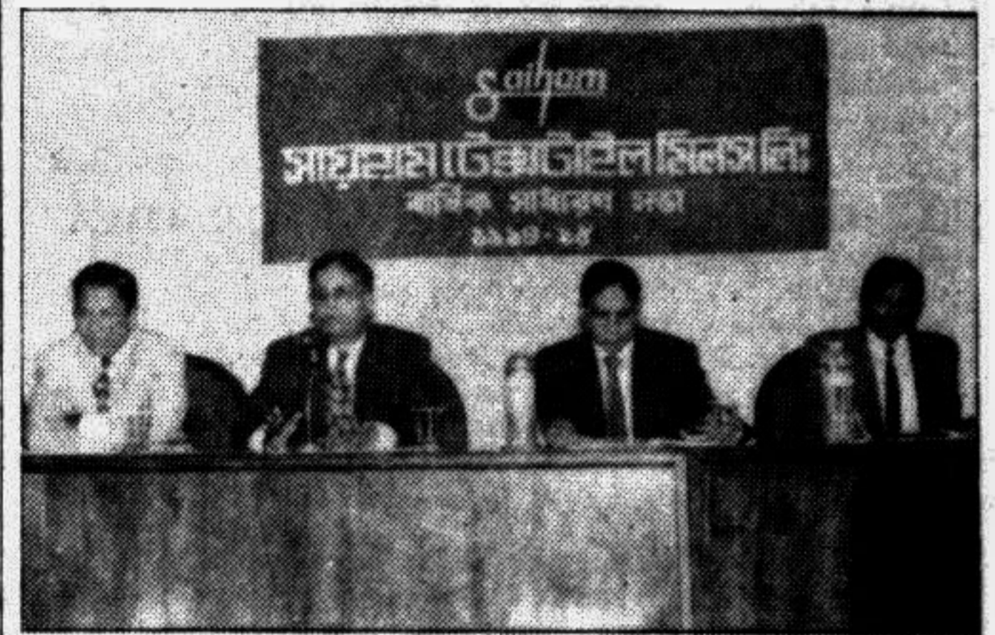
Saiham Textile Mills Ltd held its 14th annual general meeting at BCCI auditorium in the city on Thursday.

The cumulative effects of all these activities have contributed an increase in gross profit of Tk 68.7 million.