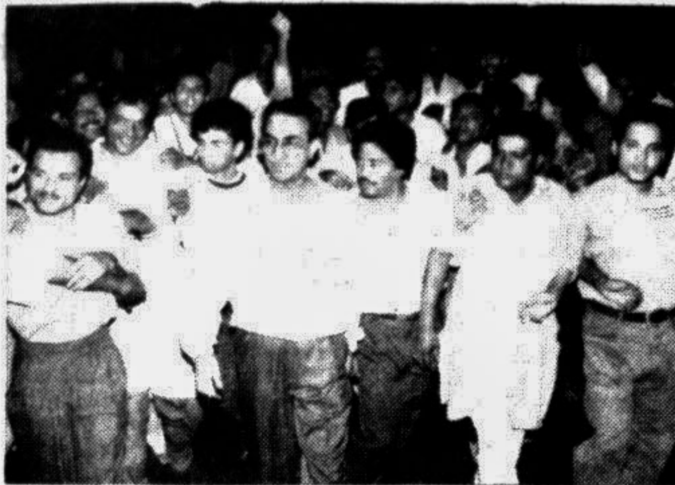
Jatiyatabadi Jubo-Dal brought out a procession in the city yesterday protesting opposition's agitation programmes.

The name, address, age and class of the participants have to be attested by their respective head masters.