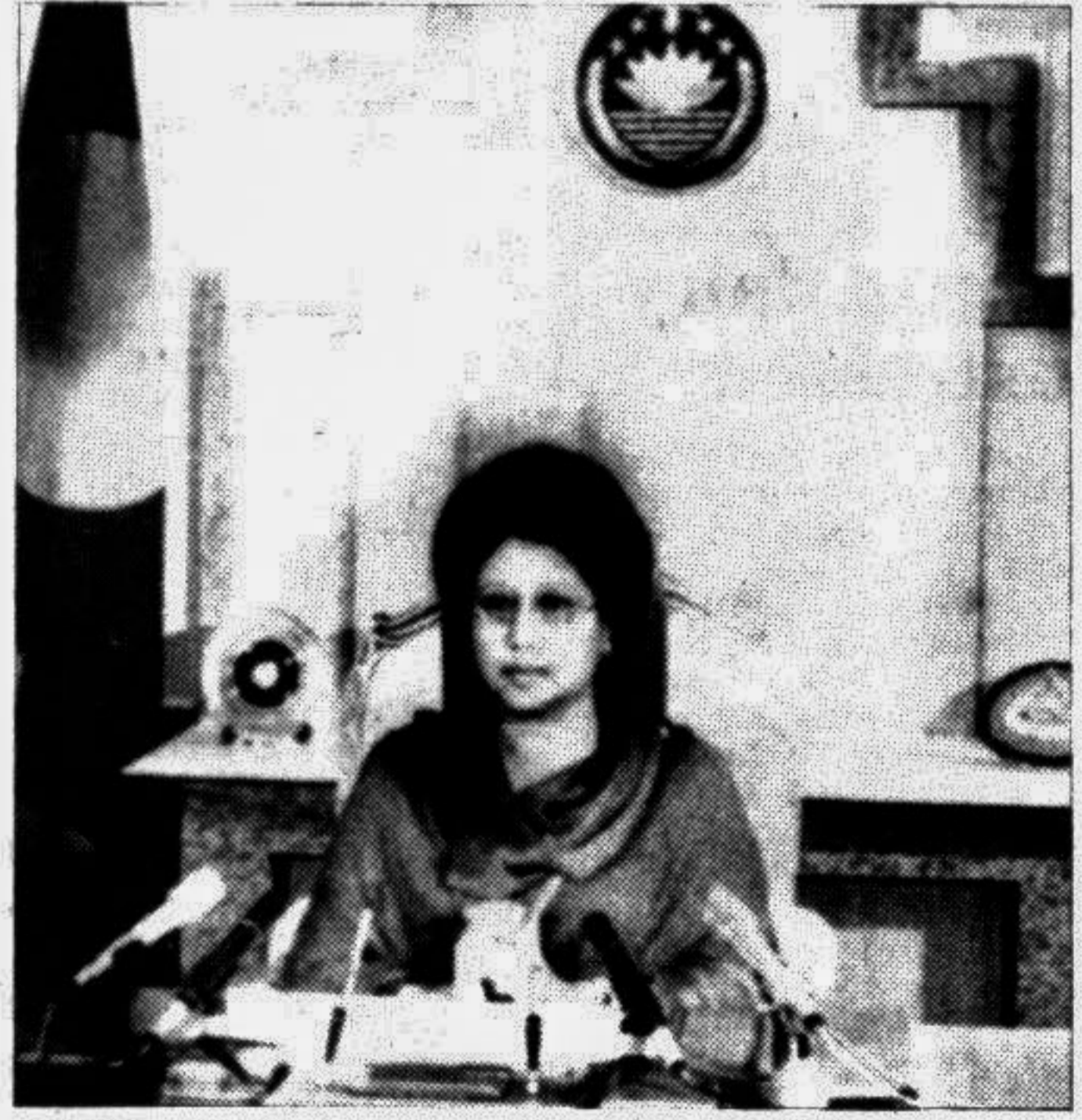
Prime Minister Begum Khaleda Zia addressing the nation over Radio and Television yesterday.

President Abdur Rahman Biswas last night dissolved the fifth Jatiya Sangsad in exercise of the power conferred on him under the Constitution. President Biswas requested Begum Khaleda Zia to continue as the Prime Minister. Prime Minister and Leader of the House Begum Khaleda Zia yesterday called on President Biswas at Bangabhaban and advised him to dissolve the Jatiya Sangsad, reports BSS.