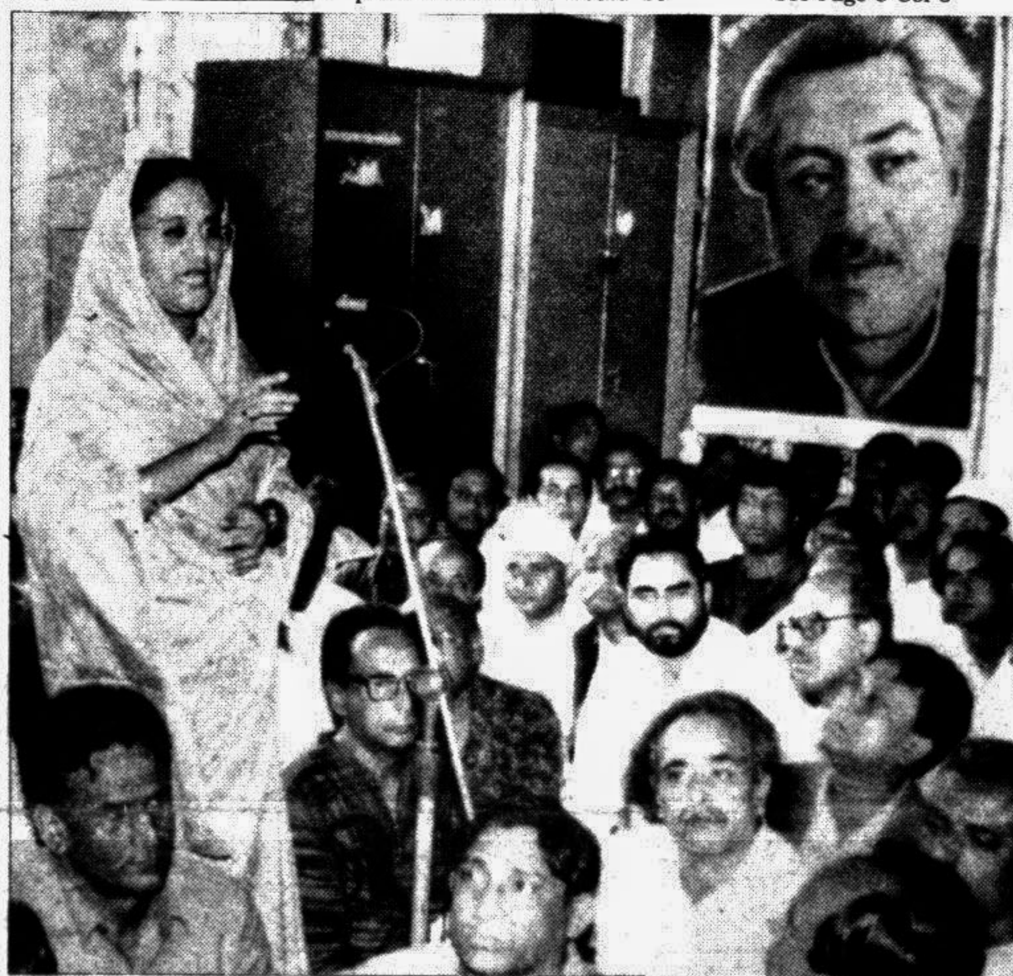
Awami League President Sheikh Hasina addressing the extended meeting of the city committee of the party at Bangabandhu Avenue office yesterday.

The body was sent to the General Hospital for autopsy. However, no case was registered till filing of this report late tonight.