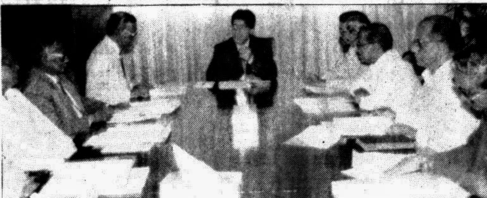
Lutfur Rahman Khan, State Minister, In-charge of the Ministry of Industries, reviewed the functioning of the joint venture projects in operation and also the progress of implementation of new joint venture industrial projects of Bangladesh Chemical Industries Corporation, at BCIC Bhaban in the city yesterday.

- Useful addresses, French firms, frequencies of French speaking radios and TV channels, organisation chart and functioning of the Foreign Affairs Ministry.