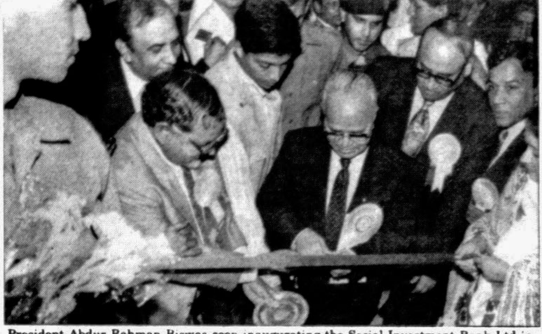
President Abdur Rahman Biswas seen inaugurating the Social Investment Bank Ltd in the city yesterday. (Story on Page 1)

digging observation wells, the irrigation experts said in their report that this had already been done by the Geological Survey of Bangladesh and BADC. About another objective of repairing and selling the BADC-owned inoperative deep tubewells, they said farmers are not so rich to buy a deep tubewell and described it as 'unnecessary technical assistance squeezing BADC activities.' For irrigation development, they suggested that medium term and long term policy for minor irrigation be adopted to use water resources properly according to a guideline prepared by local experts.