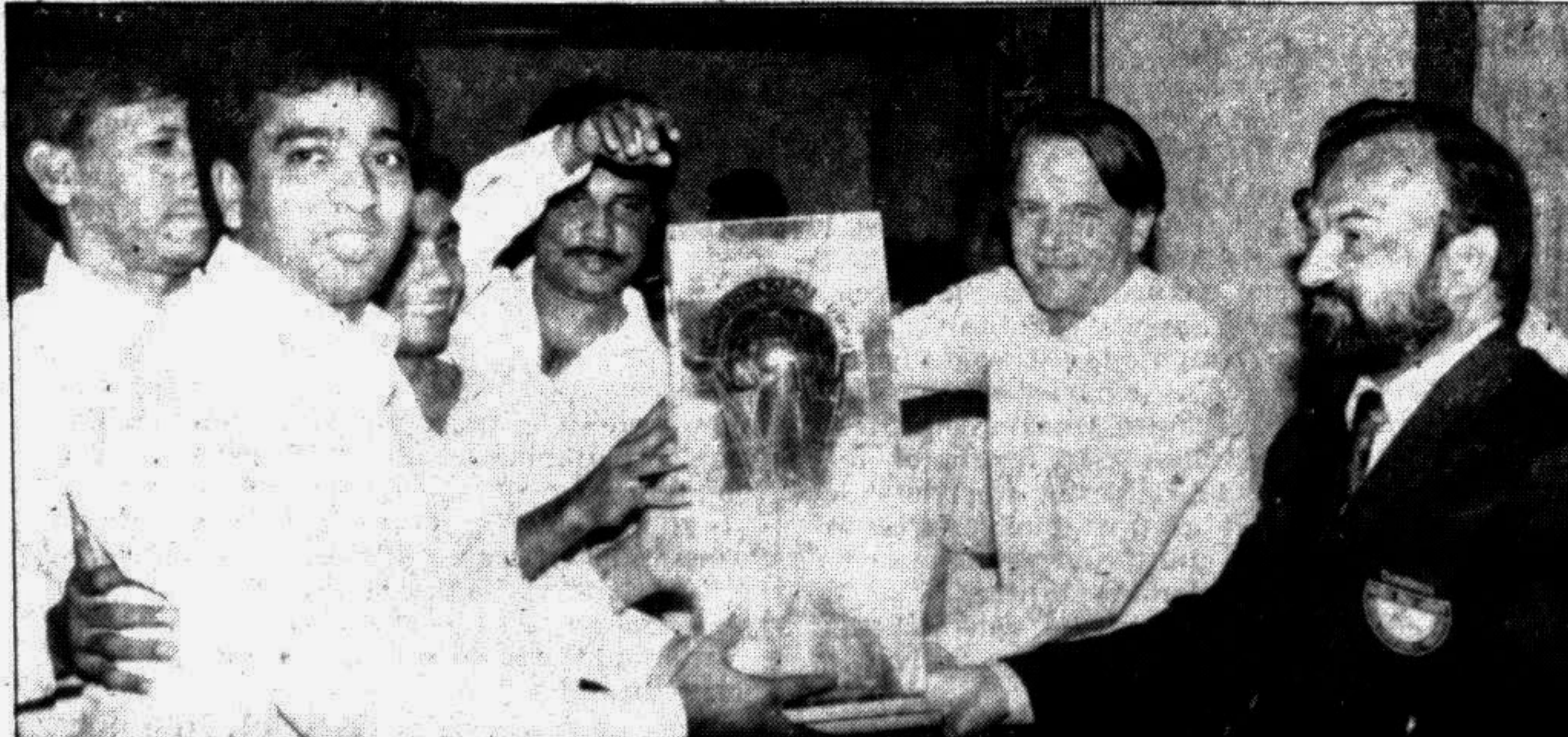
Beaming Abahani officials receiving the Lifebuoy Premier football league trophy from State Minister for Youth and Sports Sadeque Hossain at Hotel Purbani yesterday evening.

Today's Cryptogram clue: Y equals C. The Cryptogram is a substitution cipher in which one letter stands for another. If you think that X equals O, it will equal O throughout the puzzle. Single letters, short words and words using an apostrophe give you clues to locating vowels. Solution is by trial and error.