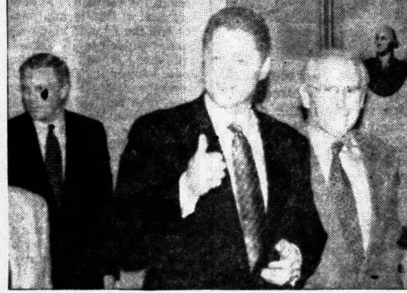
US President Bill Clinton gives a thumbs up to indicate the success of his meeting with Congressional Democrats at Capitol Hill in Washington DC on Monday as he leaves escorted by minority leader Dick Gephardt (L, and D-Mo) and Rep Vic Fazio (D-CA) (R). Clinton was in Capitol Hill to thank fellow Democrats for their support in the recent US budget crisis.