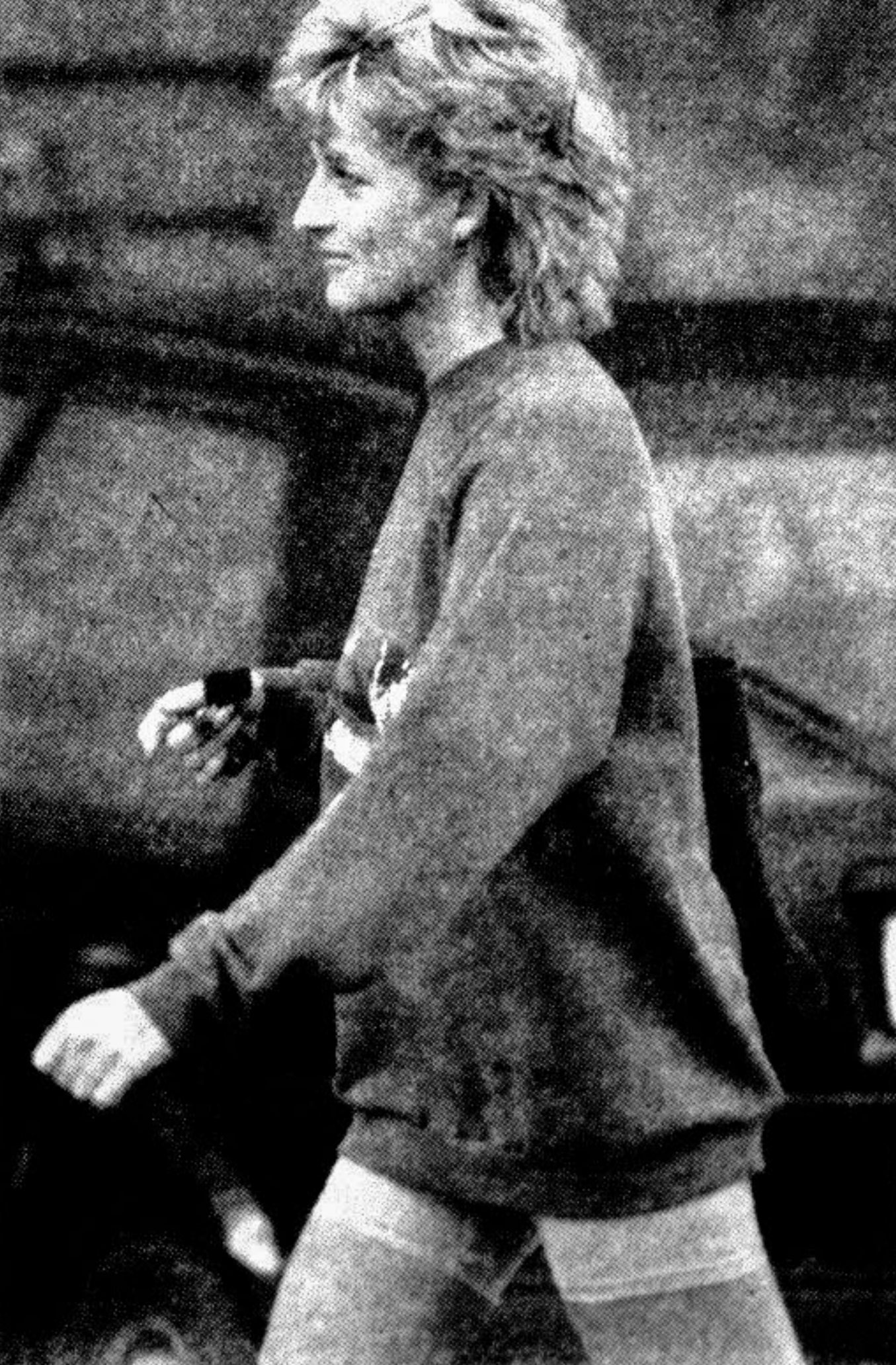
Princess Diana arrives early Monday at her London health club before her controversial TV interview.