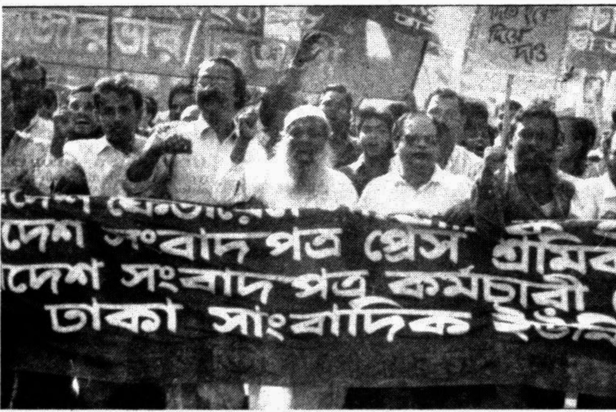
A joint rally of journalists, press workers and general employees was held in front of the Jatiya Press Club yesterday, in support of their demands.