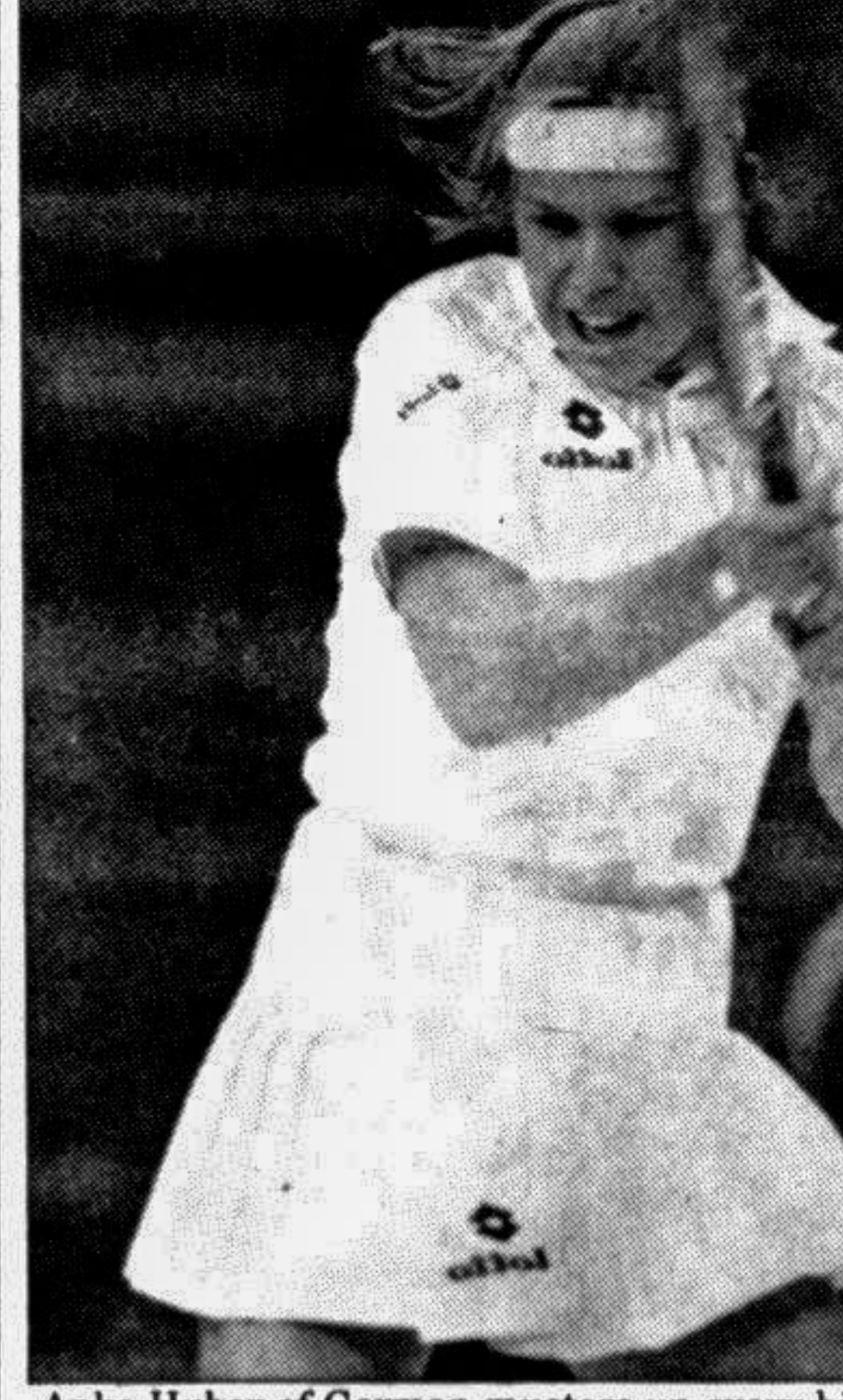
Anke Huber of German musters up every bit of strength to return a booming serve from towering Dutchwoman Brenda Schultz-McCarthy during their WTA Tour Championship semifinal clash in New York on Nov 18. Huber won 6-3, 6-3.

"I lost a little bit of concentration in the beginning of the second set," said the French Open, Wimbledon and US Open champion.