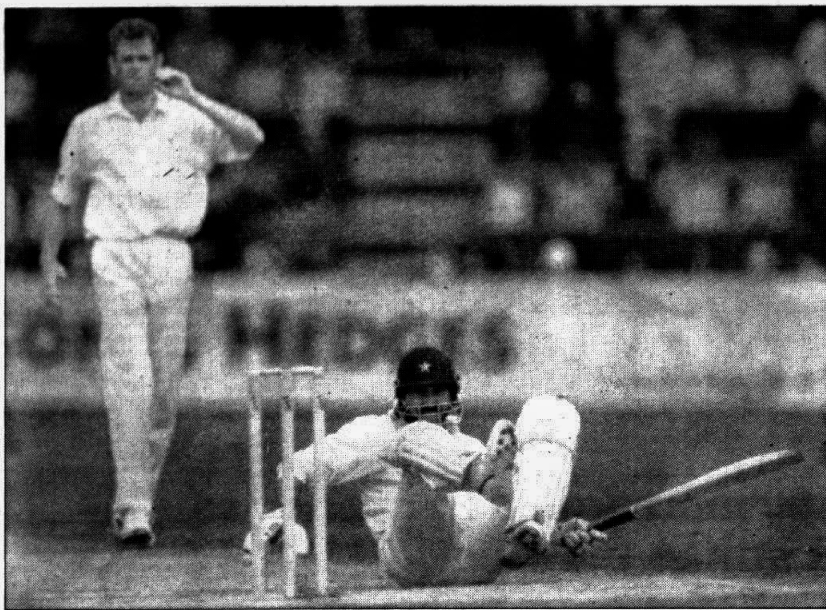
Pakistan's Rameez Raja (R) falls on the crease while taking an evasive action off a nasty bouncer as Australia's Paul Reiffel looks on during the second Test in Hobart yesterday.