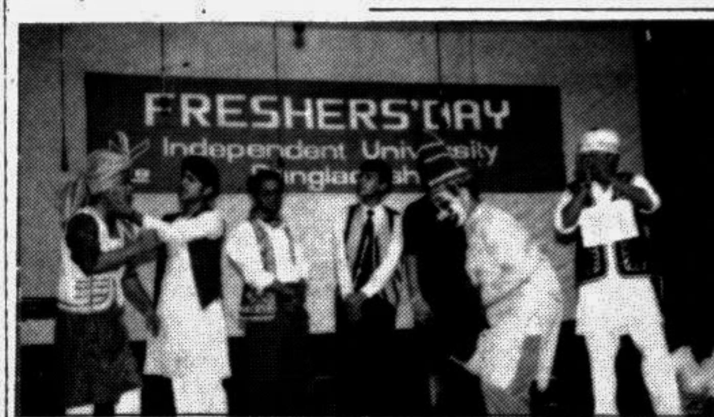
A drama was staged as part of the cultural programme arranged on the occasion of the Freshers' Day of IUB in the city recently.

The function was attended by members of the governing council, trustees, donors and parents and guardians of the students and members of the faculty.