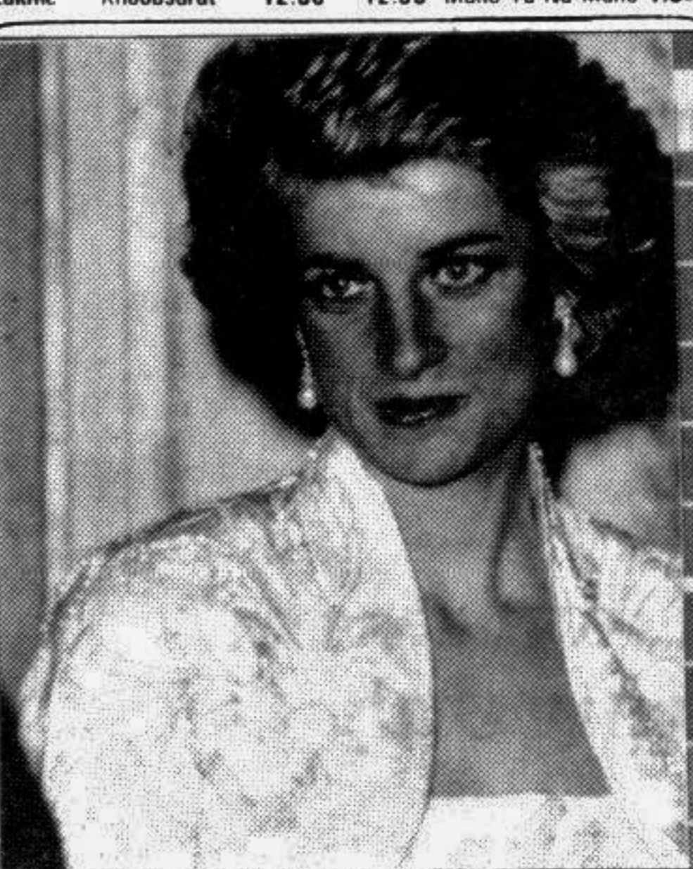
Princess Di in Panorama on BBC World, Tuesday at 3:40 am

STAR MOVIES 7:30am Gold : Jack The Bear (Arabic Subtitles) 9:30 Sunday (Classic Western: Firebrand (PG) (Arabic Subtitles) 11:30 Family: Nurses on the Line (Hindi Subtitles) 1:30 Adventure: Arabian Adventure (Hindi Subtitles) 3:30 Sunday Show Time : Sherlock Junior (PG) (Hindi Subtitles) 4:30 Sunday Showtime: Phantom Empire (Hindi Subtitles) 5:30 Sunday Classic Western: Firebrand (Hindi Subtitles) 7:30 Comedy : Dutch (PG)(Hindi Subtitles) 9:30 Film Club: My Beautiful (Hindi Subtitles) 10:00 Laundrette (Hindi Subtitles) 11:30 Gold Kickboxer III (Arabic Subtitles) 1:30 Gold : Dead Ringers (Arabic Subtitles)