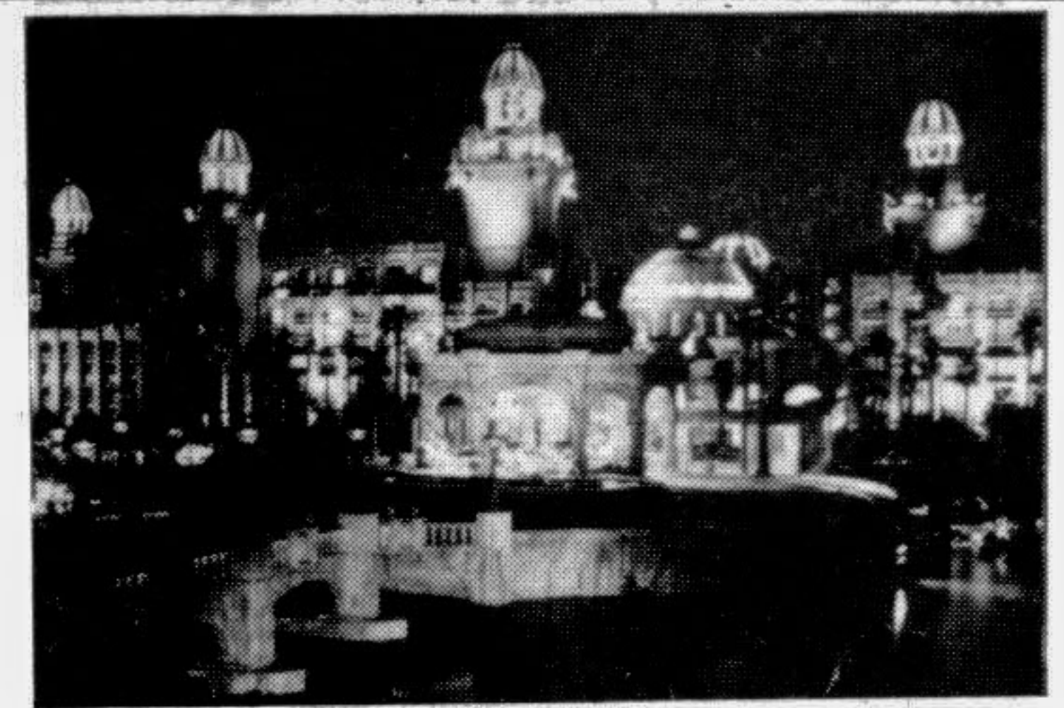
The venue of Miss World '95. Delayed telecast of the competition on Star Plus, Tonight at 9:30