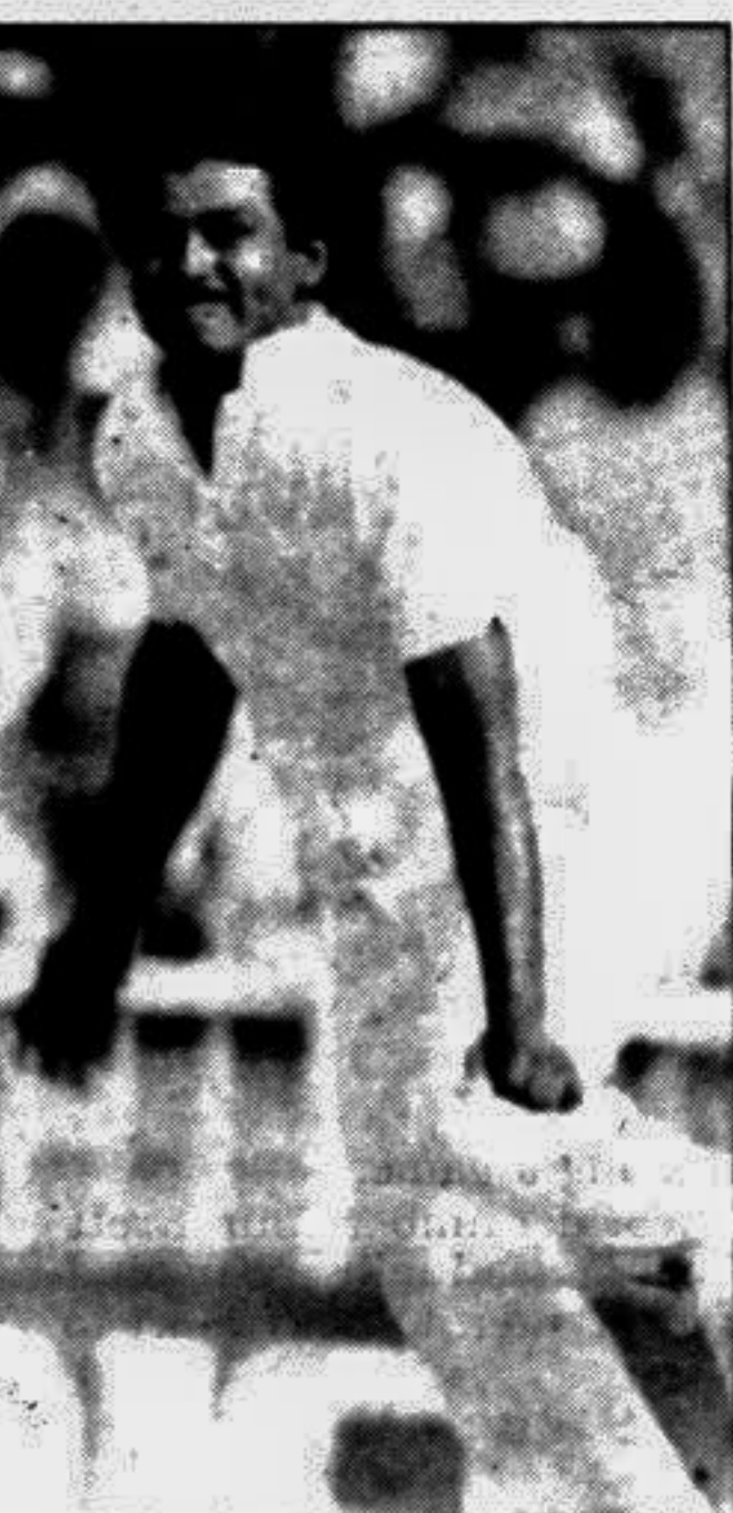
MUSTAQAQ ... 5 for 115

quick single. There was some confusion surrounding the dismissal because the television link to the third umpire in the pavilion broke down several minutes before the incident.