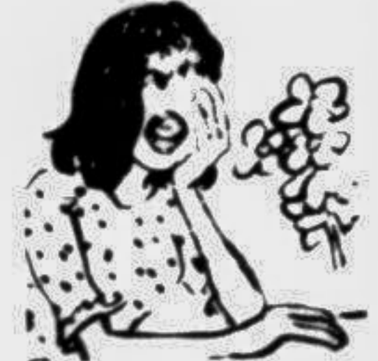
A Room with no View Page 3