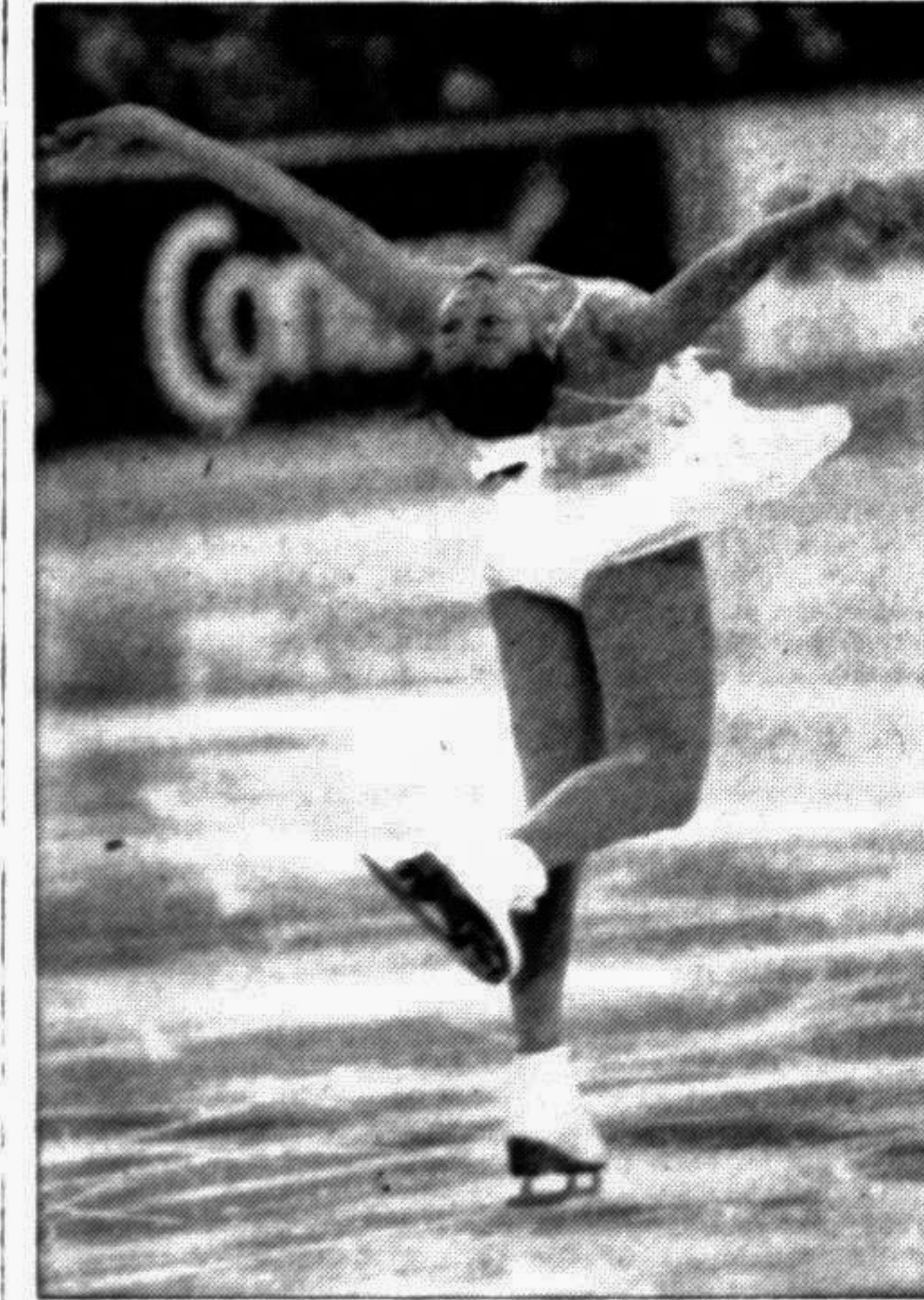
World champion Lu Chen of China performs her majestic display of skills in a preparatory programme of the French ice skating championship at the Bordeaux ring, southwestern France, on Nov 15.

The Dutch finished second in Group Five behind the Czech Republic who wrapped up the group by beating Luxembourg 3-0.