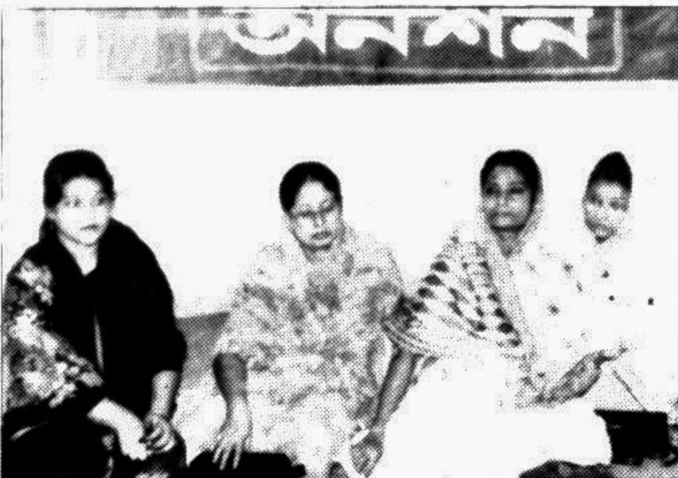
Begum Raushan Ershad, wife of former president H M Ershad, along with three other members of her family, began a fast unto death at the JP central office at Banani in the city yesterday, demanding immediate shifting of ailing Ershad from the Dhaka Central Jail to a hospital.