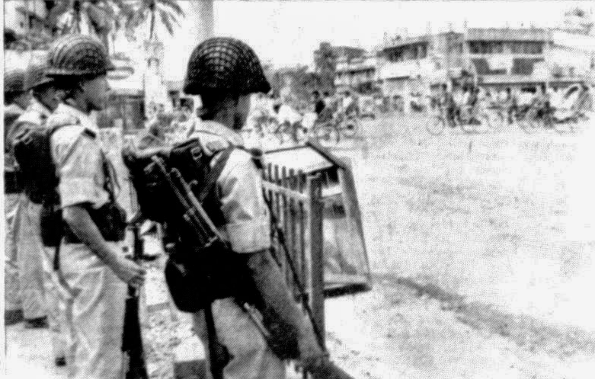
A BDR patrol at Purana Paltan in the city during hartal hours yesterday.

10 years. Most of them, according to the sources, had travelled to Pakistan over land via India with forged documents. The Pakistan government recently started a massive crackdown on Bengali-speaking workers in Karachi. Following the crackdown, many people paid Rs 12,000 to 13,000 to travel agents who procured the forged passports and tickets for their return, the returnees told police. The 282 returnees arrived at the ZIA, in two different batches from Karachi on Saturday, according to the sources. See Page 12 Col 8