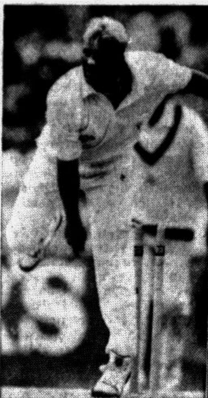
WARNE ... 7 for 23

BRISBANE, Nov 11: Aamir Sohail led Pakistan's fight to avoid an innings defeat in the first Test against Australia today with a superb 99 after spinner Shane Warne routed the tourists to force the follow-on, reports Reuter. The aggressive left-handed opener fell one run short of a deserved third