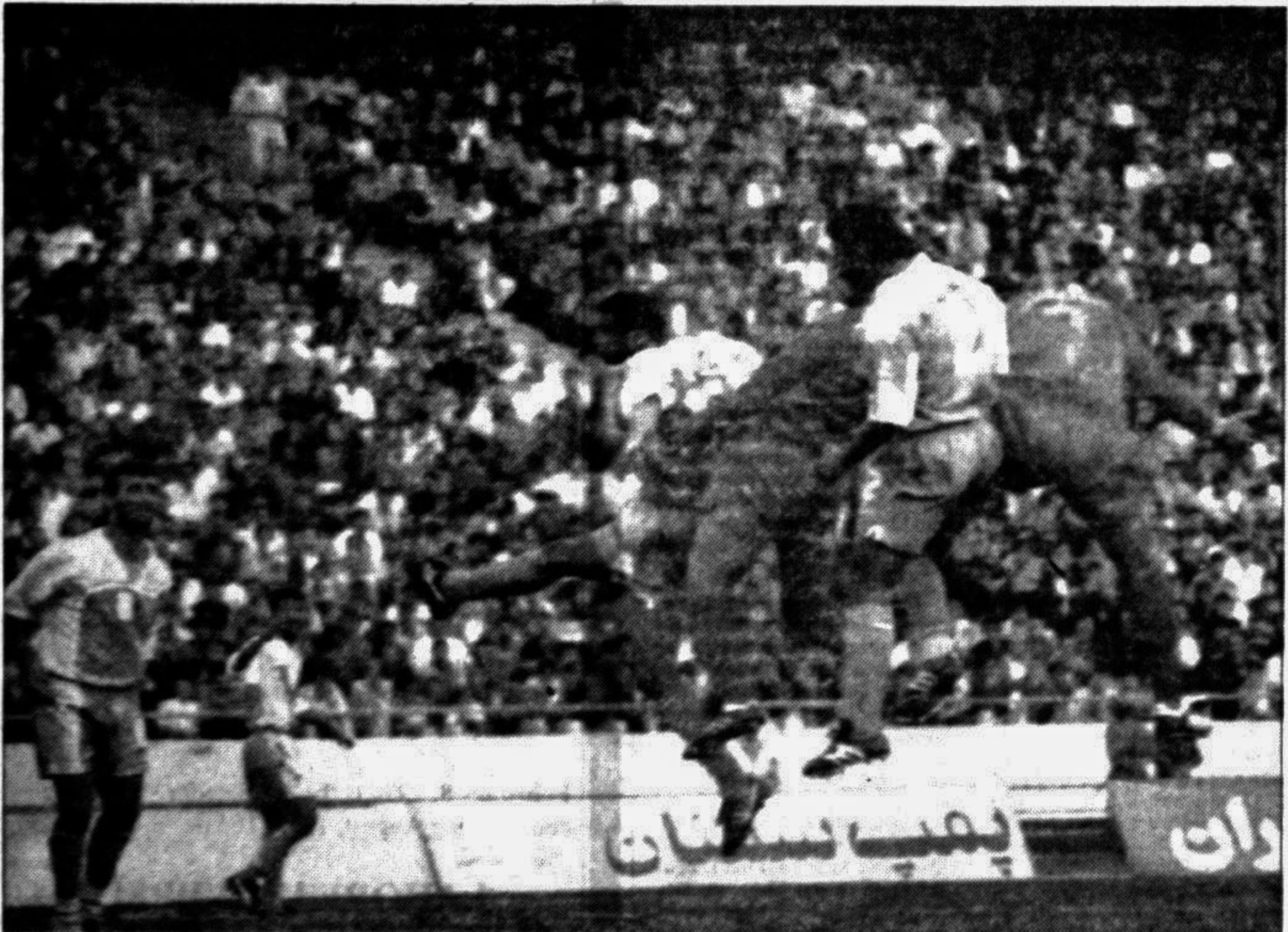
ON DEADLY GROUND! Players of Tehran's Bahman club (light jerseys) and Baghdad's Talabeh are involved in an aerial tussle during the first soccer match between Iranian and Iraqi teams in Teheran on Nov 10 since the 1980-88 conflict.

Higuaita, famous for his charismatic and sometimes reckless style of goalkeeping, was playing for an America XI against a Europe XI in Barcelona on Tuesday when he was injured.