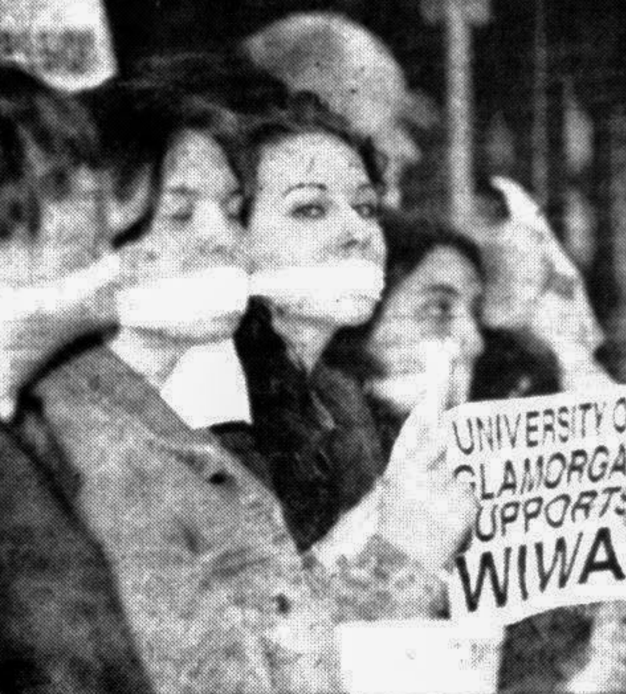
Gagged students protest outside the Nigerian Embassy at the death sentence on Nigerian Ogoni rights activist and author Ken Saro-Wiwa and eight other Ogoni activists which was handed down by a military court on Friday. Ken Saro-Wiwa's death sentence has been internationally condemned at this week's Commonwealth Heads of Government meeting in Auckland.

Benazir in Tashkent: Pakistani Prime Minister Benazir Bhutto arrived in Tashkent yesterday for a half-day visit to discuss the civil war in Afghanistan with Uzbek leaders, saying a "Power-sharing formula" was that only solution in Kabul, AFP reports from Tashkent.