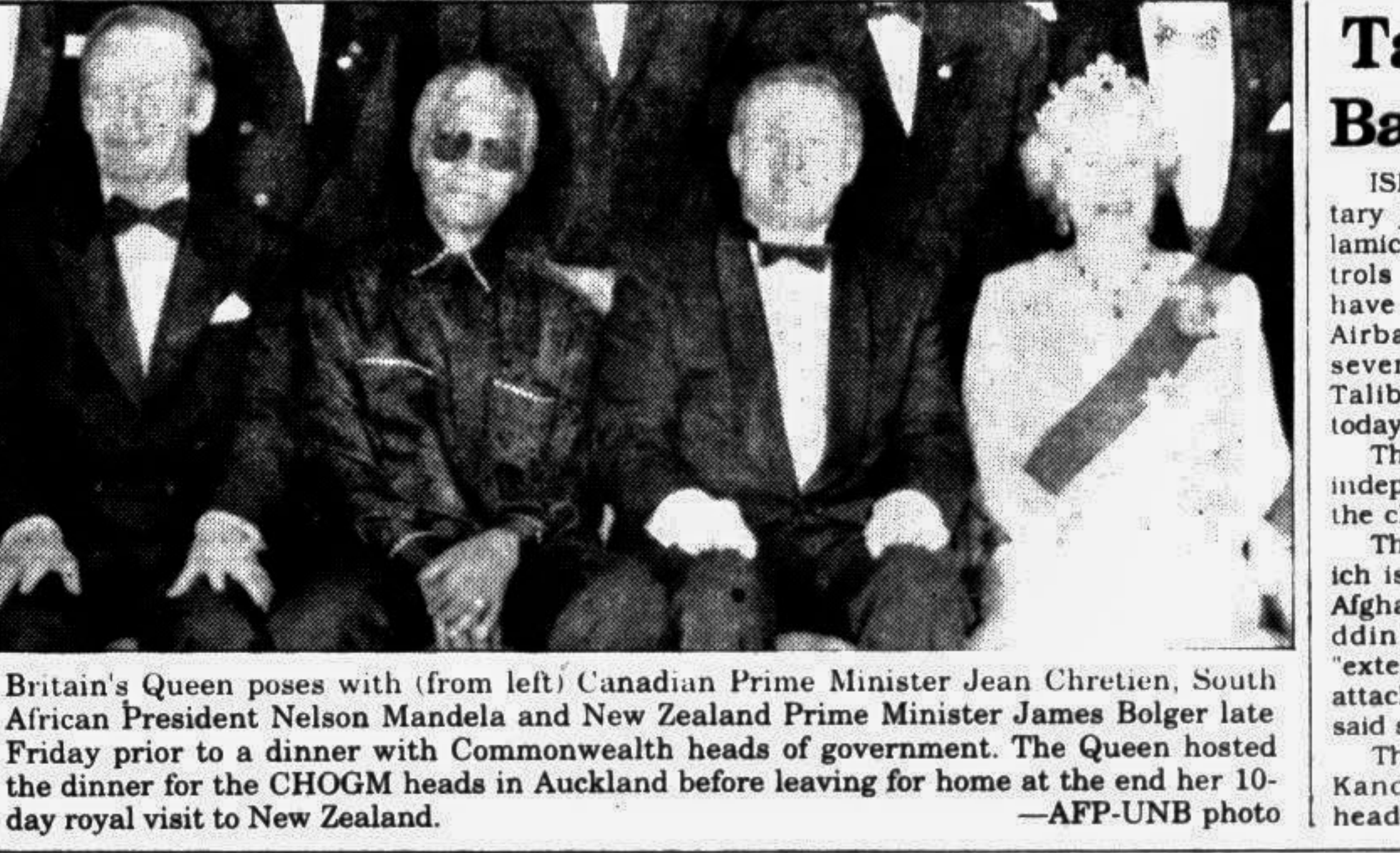
Britain's Queen poses with (from left) Canadian Prime Minister Jean Chretien, South African President Nelson Mandela and New Zealand Prime Minister James Bolger late Friday prior to a dinner with Commonwealth heads of government. The Queen hosted the dinner for the CHOOGM heads in Auckland before leaving for home at the end her 10-day royal visit to New Zealand.

BEIJING: China will turn a panda breeding centre into a tourist destination where the endangered animal can be viewed in its natural habitat, the Xinhua news agency said Saturday, reports Reuter. China Panda World will be built at the foot of mount Futou in southwestern Sichuan province, home of an estimated 1,000 pandas still living in the wild, the official agency said. The completion of the park will liberate pandas from behind bars in the zoo, while saving tourists from the inconvenience and risks of exploring nature reserves to see pandas," a Panda World official told Xinhua in the Sichuan capital Chengdu. The park, north of Chengdu, will open by 2020, the report said. It gave no details of how the tourist attraction would be operated. China has mastered the captive breeding of giant pandas, which are featured attractions in zoos worldwide. But human encroachment on the bamboo forests where the creature evolved has long threatened it with extinction.