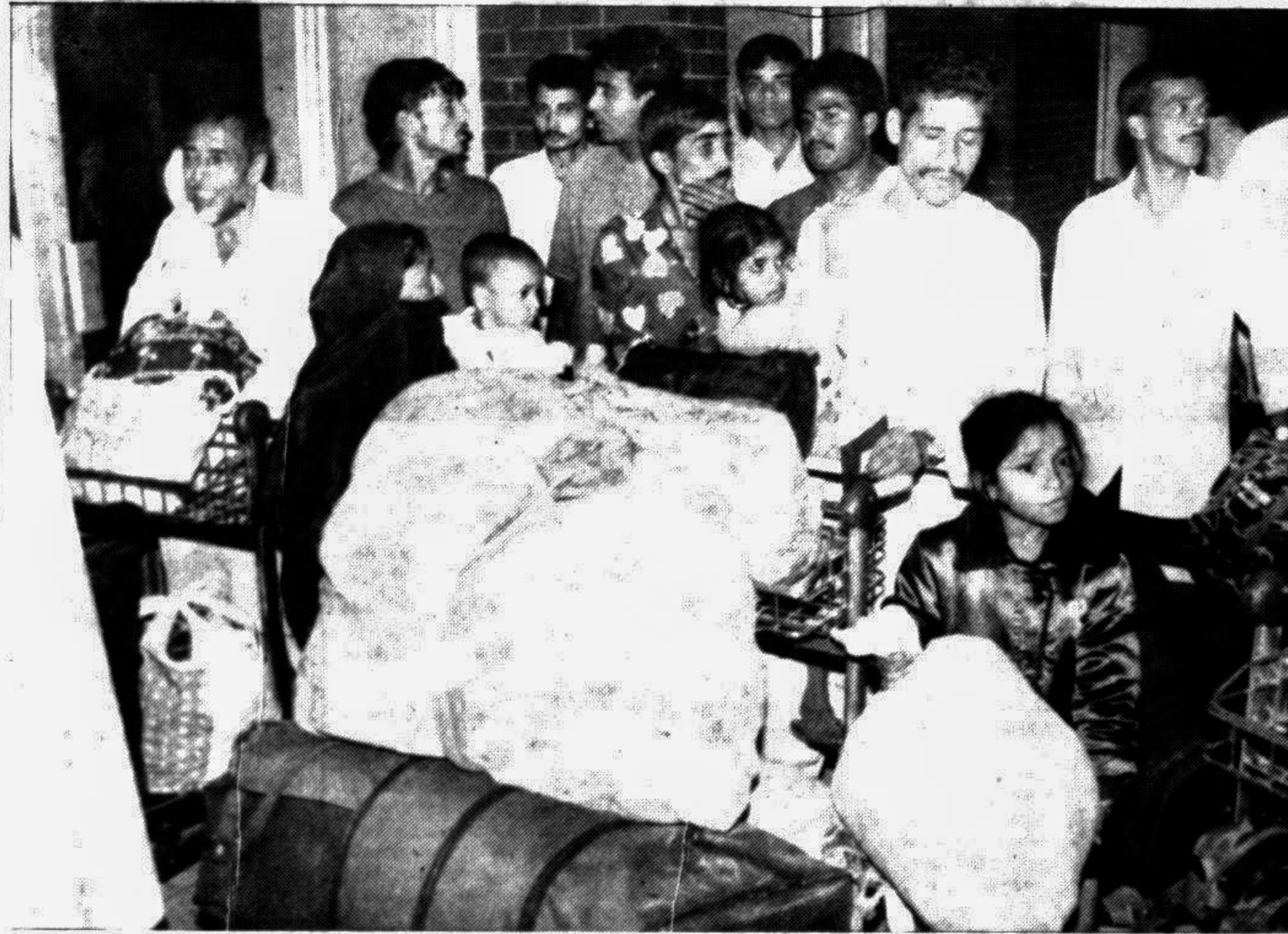
A group of alleged deportees from Pakistan at ZIA yesterday.

Meanwhile, some unidentified youths hurled 3