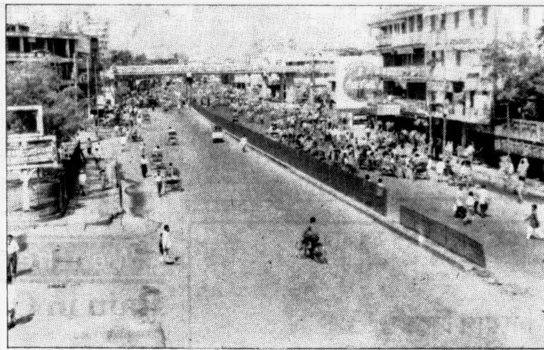
Farmgate area in the city during hartal hours yesterday.

In the city, besides the four who were killed, over 100 others were injured in