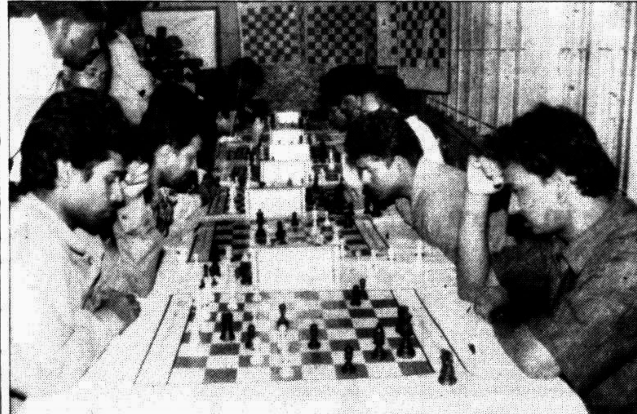
A scene from yesterday's First Division chess league matches from the chess room of the Bangladesh Chess Federation.