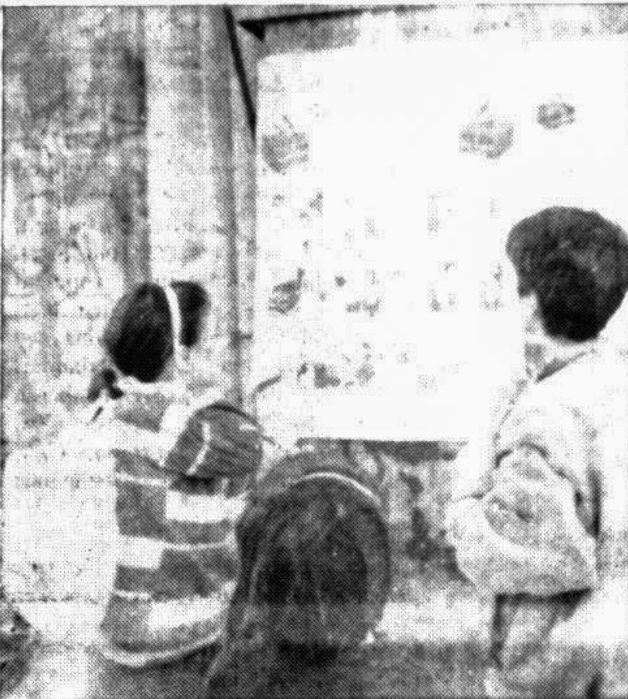
Palestinian children look at the first election posters pinned up in the West Bank town of Hebron on Thursday. European observers began arriving in the West Bank to monitor the first Palestinian elections, as a massive campaign was launched calling on people to take part in the poll.

15 die in Kashmir bus plunge: At least 15 people were killed and 20 others injured when a bus in which they were travelling plunged into a gorge in the northern Indian state of Kashmir, police said in Jammu yesterday. AFP reports from Jammu. The police said the victims were mostly Hindu devotees travelling to a temple in Kashmir's Sarthal village.