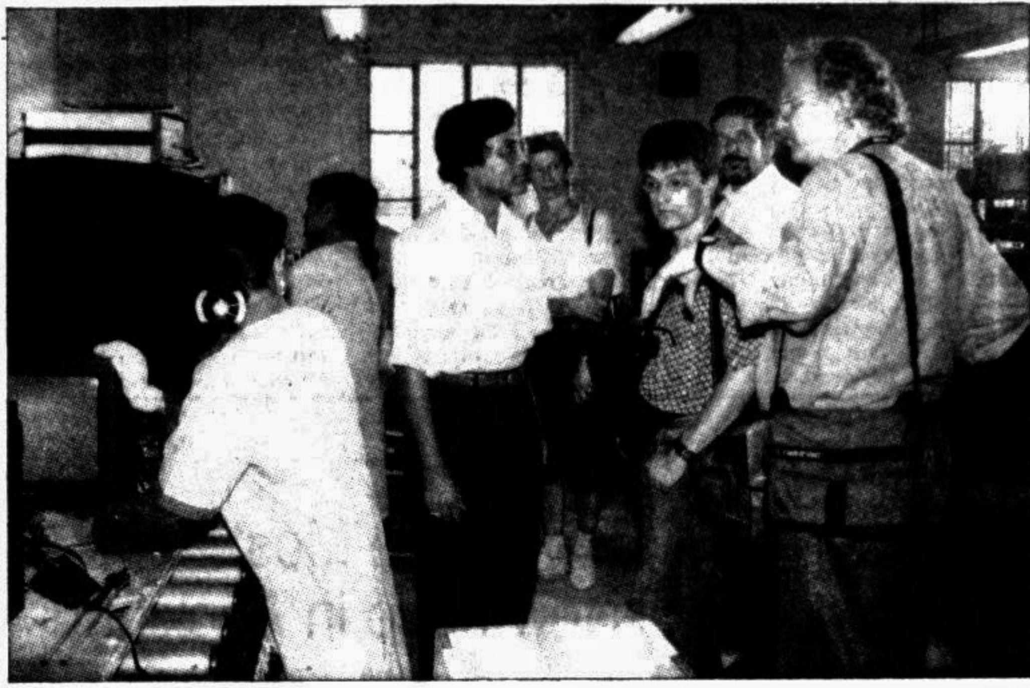
Swiss journalists, UCEP officials visiting Singer plant at Hemayetpur in Savar.

According to the sources, company law and corporate affairs have become increasingly complex and senior judges experienced in commercial law will be appointed to these new courts.