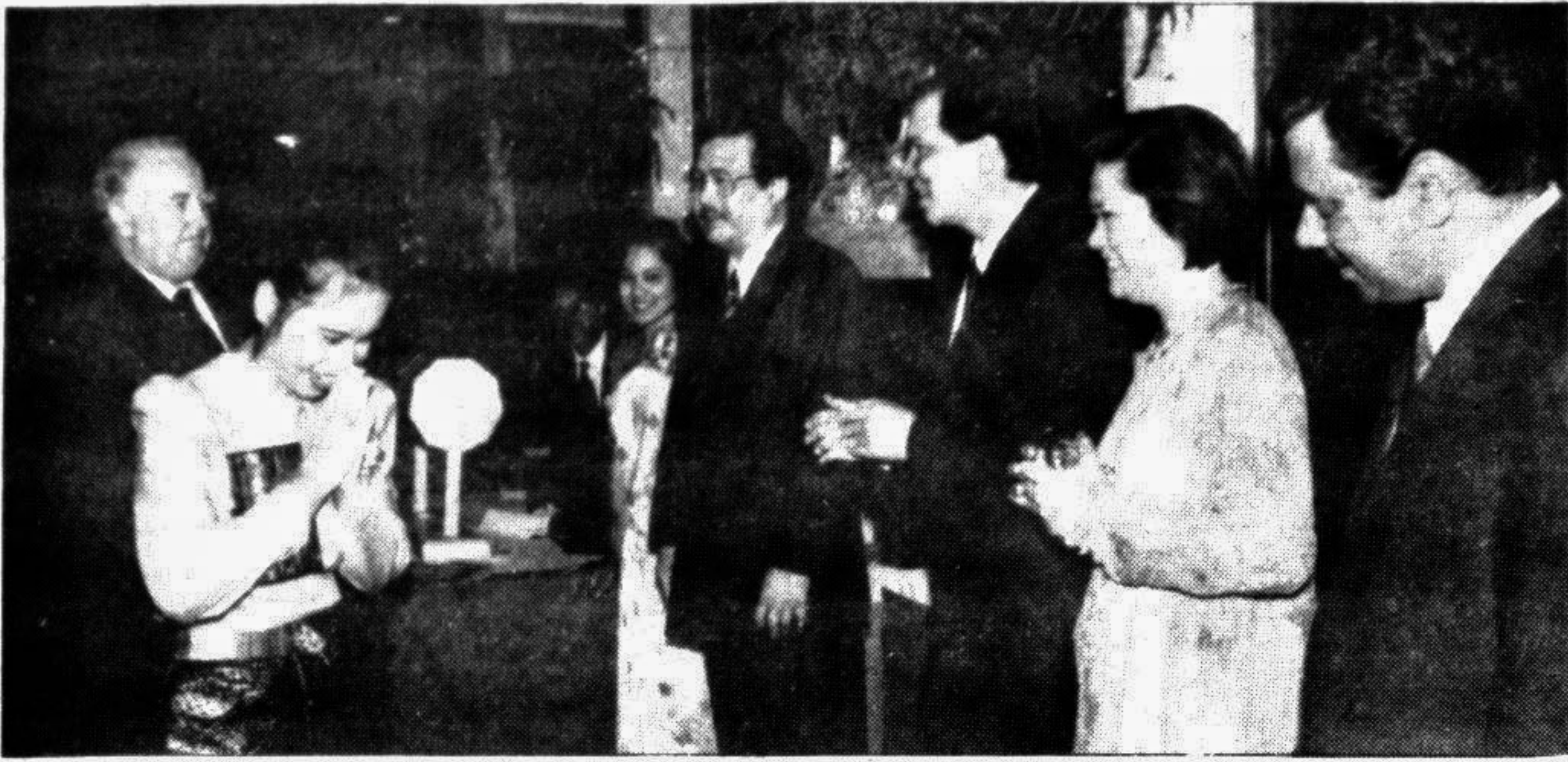
A reception was held on the occasion of the 35th anniversary of Thai International Airways at the Sheraton Hotel yesterday.