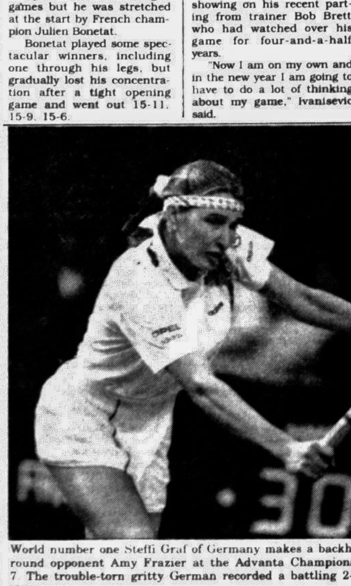
World number one Steffi Graf of Germany makes a backhand return against her second round opponent Amy Frazier at the Advanta Championships in Philadelphia on Nov 7. The trouble-torn gritty German recorded a battling 2-6, 6-4, 6-2 win over the American.