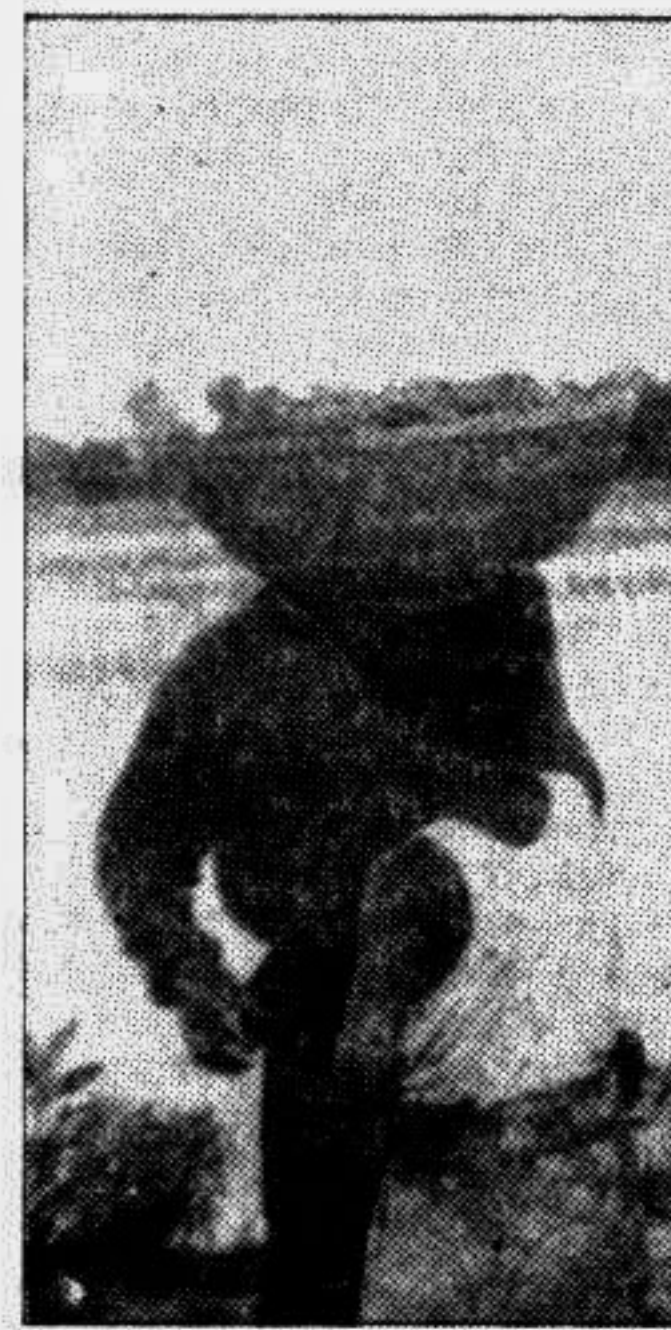
PABNA: Farmers carrying seeds for cultivation under Agriculture Rehabilitation Programme after the recent flood in an affected area in Bhangoora thana.

rabi crops could be cultivated in a massive scale. For this purpose, the most important pre-requisite was the adoption of wide-spread irrigation network since the season in question puts the district and also the surrounding districts of the north and south into extreme shortage of underground water level with fur-