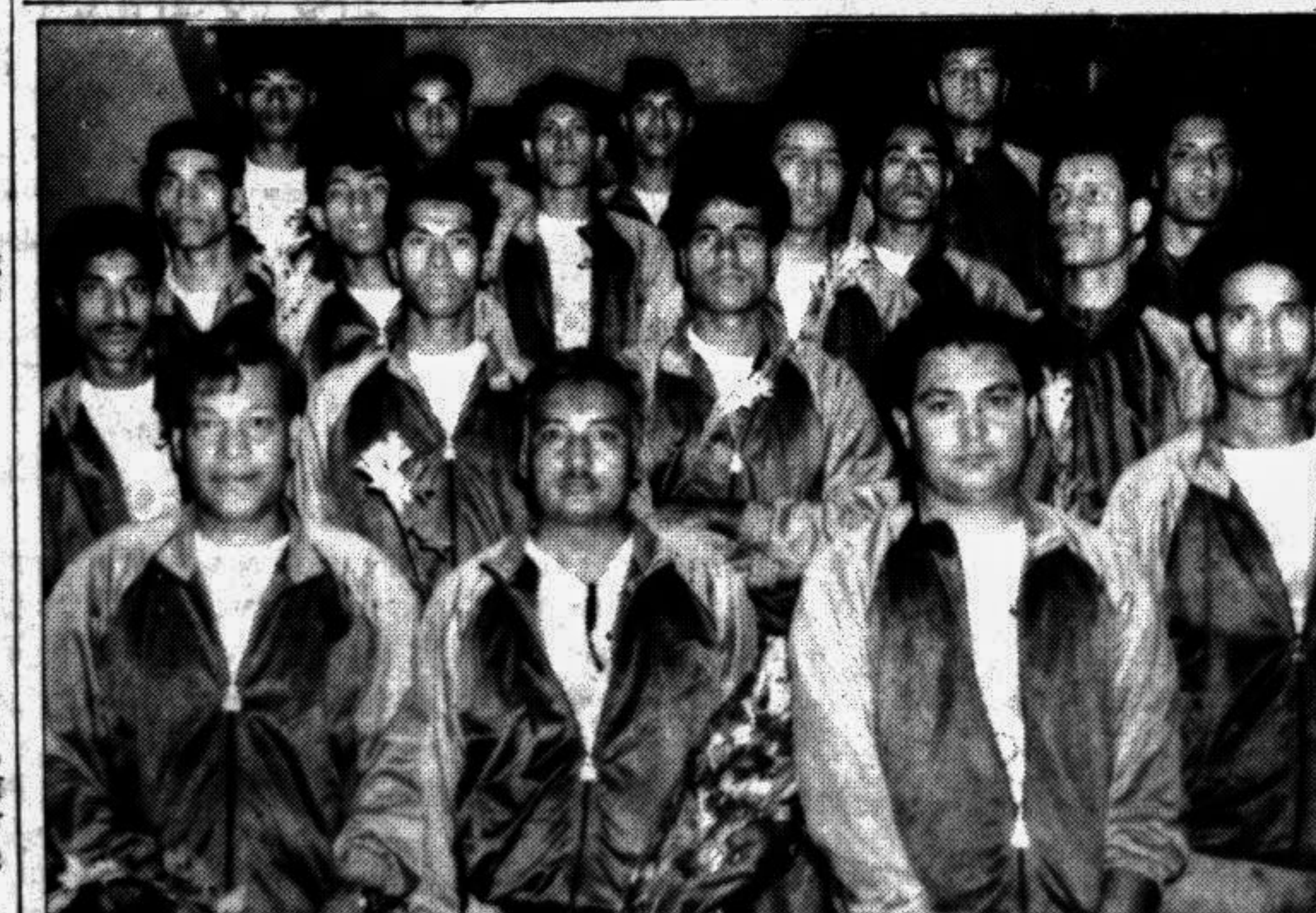
An 18-member Nepalese volleyball team pose for photographers after their arrival in Dhaka yesterday on a week-long visit.

The league will have a break today (Monday) and the fifth round will start tomorrow at 2 pm at the same venue.