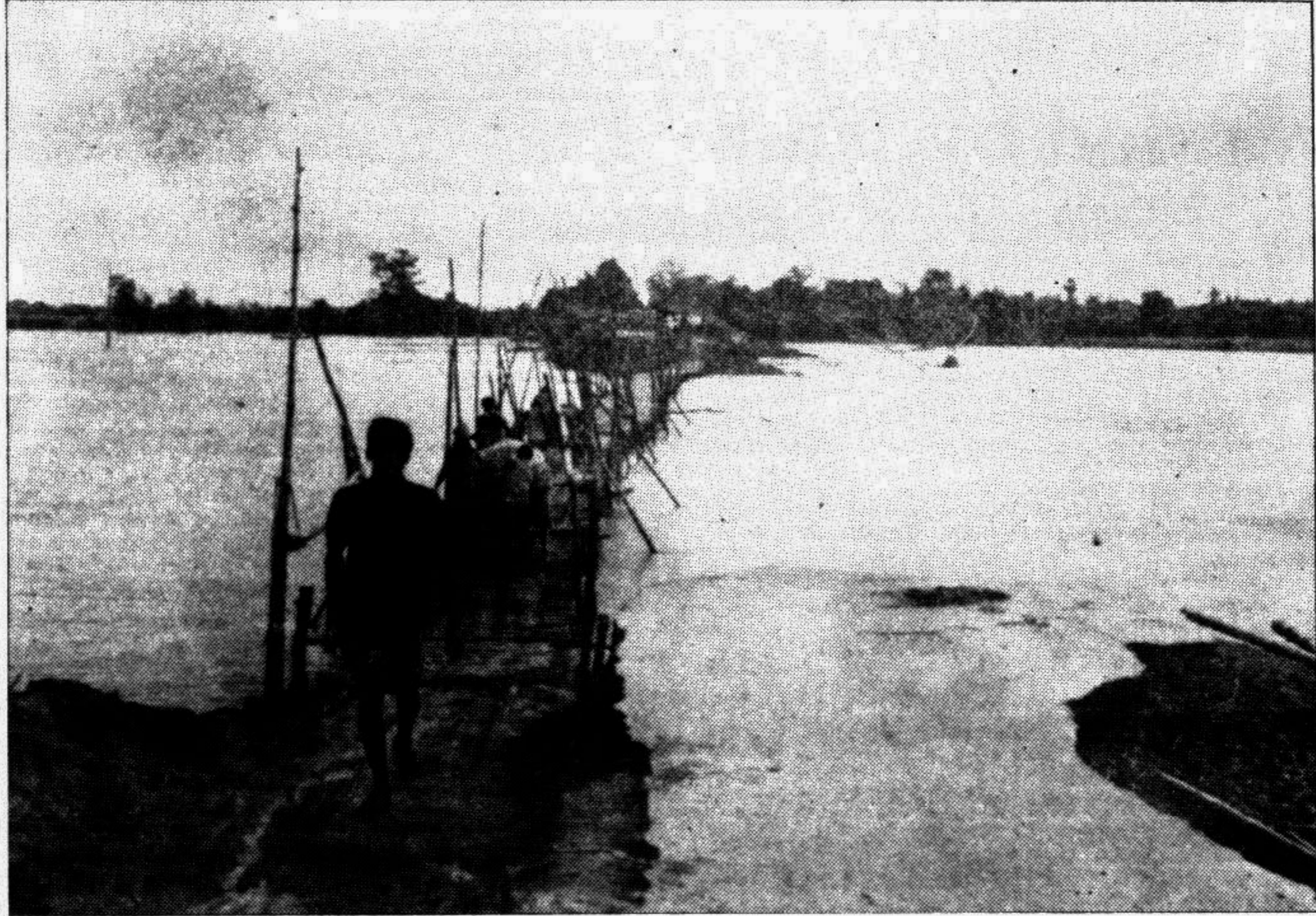
SIRAJGANJ: A part of the Sirajganj-Kazipur road washed away during the recent devastating flood in the district. Repairing work could not be started yet as flood water remained stagnant in some places.

terlogging still persists in the fields. Local people informed this correspondent that it will take at least another three weeks to naturally dry up the lands. When contacted, a source of the district administration told The Daily Star that works on Test Relief projects and other road repairing schemes will be started soon and soil required for earth work for repairing and reconstructing of rural roads will be available by November 15.