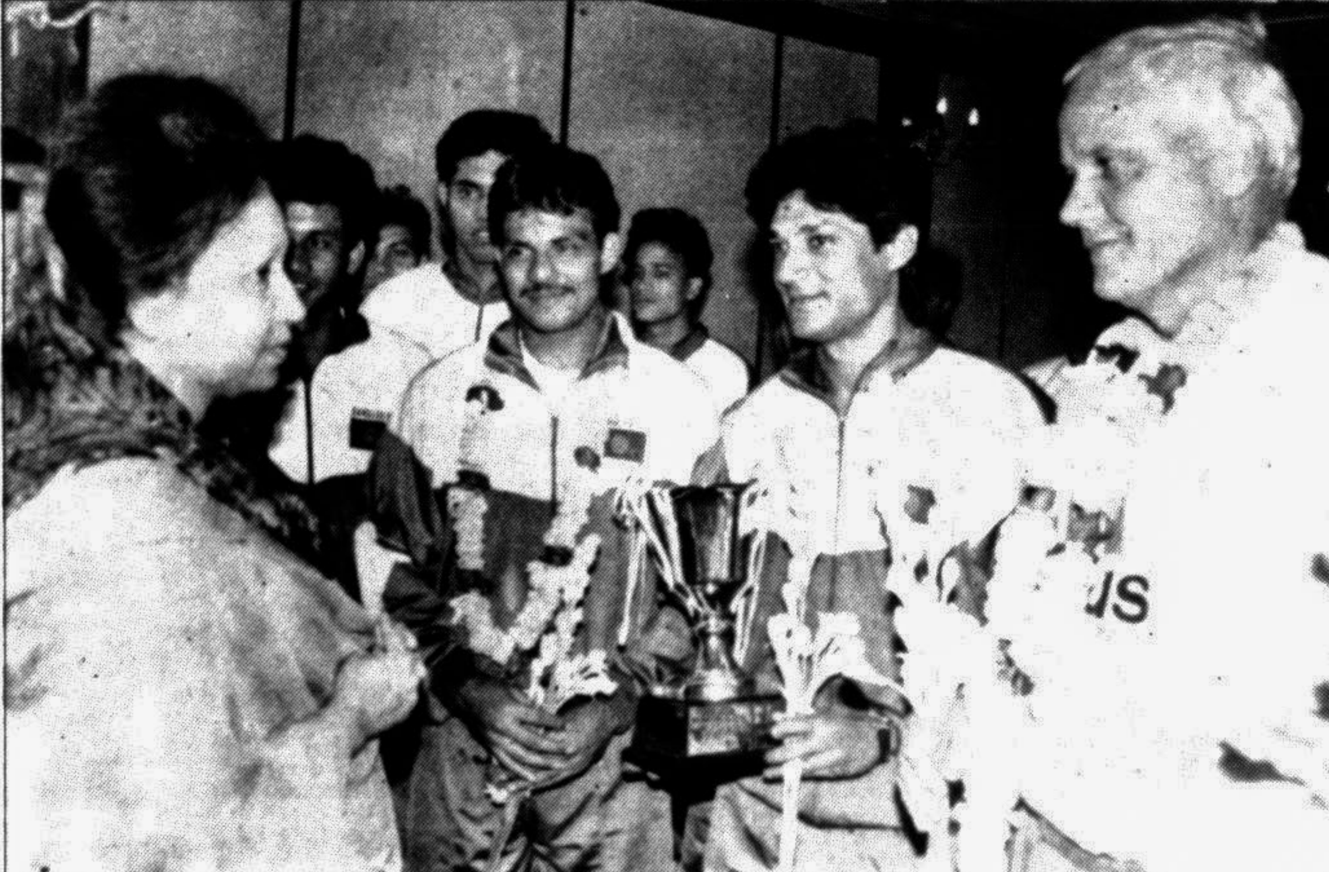
Prime Minister Begum Khaleda Zia talking to members of the national football team at a welcome ceremony yesterday at the International Conference Centre in the city. The team that won International trophy in Yangon returned home last night.

The Prime Minister's call came on the eve of a countrywide dawn-to-dusk road-rail-waterway barricade the major opposition parties are set to enforce from tomorrow morning to press for general elections under a neutral caretaker government. Begum Zia was addressing a mammoth public meeting at Chandpur Stadium here in the afternoon. Amid cheers, slogans and repeated applause, she expressed her firm determination to continue the constitutional process at any cost. It is legitimate, the Prime Minister observed, to build resistance against those who keep the people hostage, halt rickshaws, close shops and deprive the day labourers of incomes in the name of establishing the right to food. "Now there is no alternative but to build resistance against those who do not even spare the people who live from hand to mouth," she said, adding "the opposition parties in the name of establishing people's right to food are leading their programmes to 'keep the people unfed.'" Begum Zia further called upon the people stand against all sorts of repression and illegal activities the Opposition is indulging in. She told the gathering that the Opposition was upset to see the country march