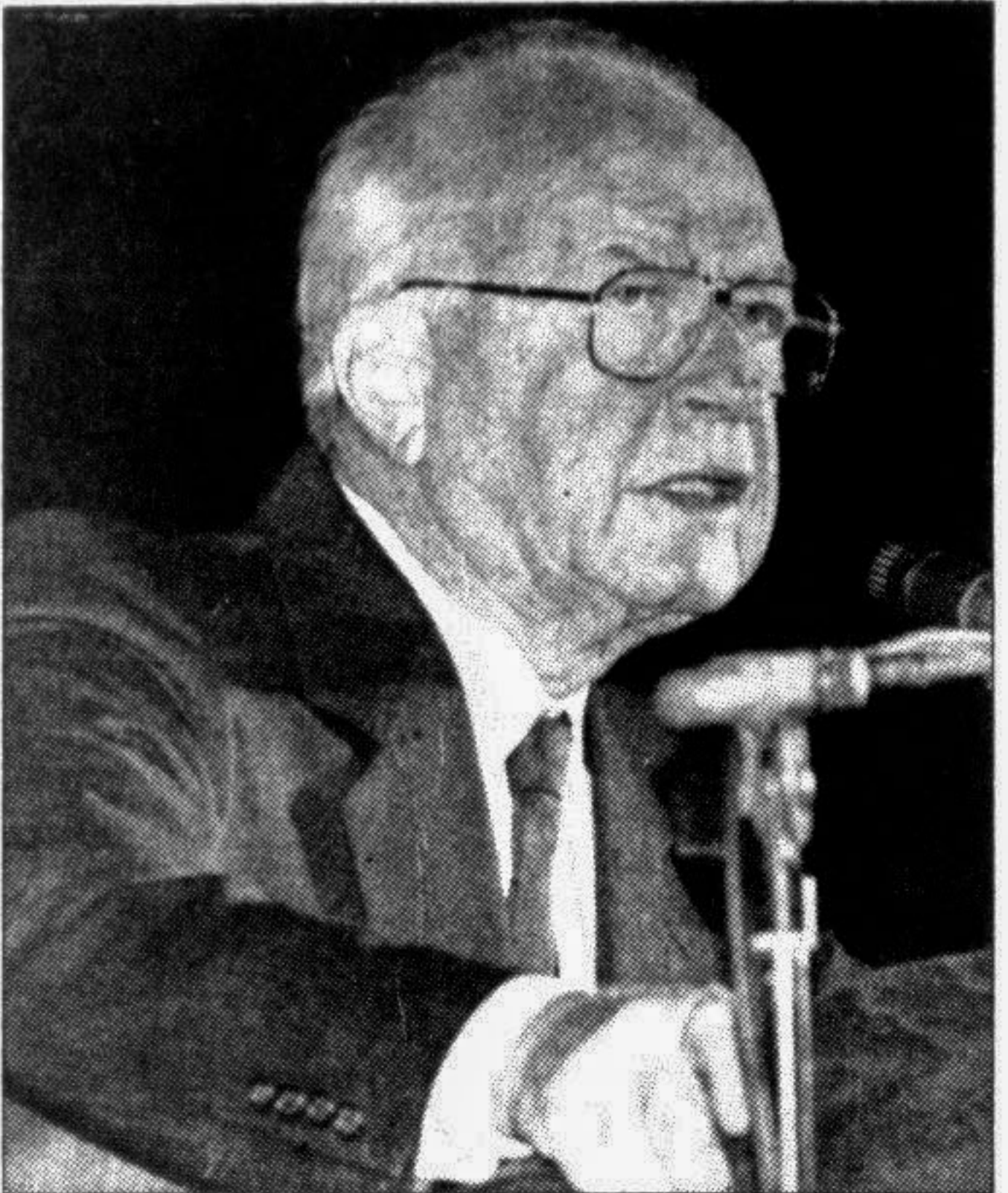
THE LAST SPEECH: Rabin addressing the rally 'For Peace - Against Violence' attended by tens of thousands of Israelis at Tel Aviv Saturday

All newspaper offices will remain closed on November 7 on account of the National Revolution and Solidarity Day, a press release of the Bangladesh Sangbadpatra Parishad said yesterday, reports BSS.